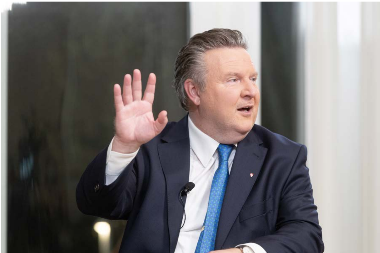
Mayor Michael Ludwig says hi to the crowd that consists of panelists.

Seniority is key to the success of this idea. When you put out the call to your readers, you need a name they want to meet: a respected figure with a lot of credibility to act as spearhead. You can look outward for this effect too: during the pandemic, we invited the Mayor of Vienna, Michael Ludwig, for a TV interview. The audience was composed of Readers' Panelists who were able to ask questions and raise concerns.