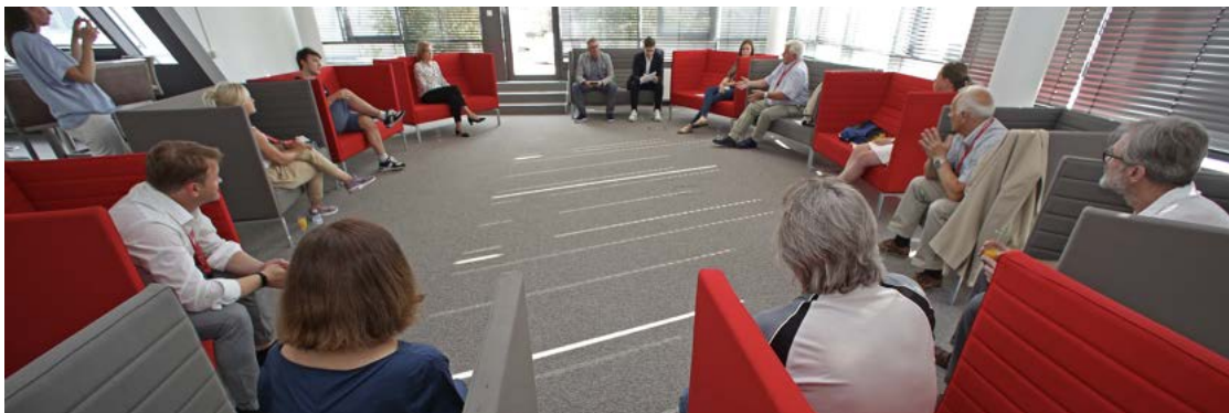
The first Readers' Panel meeting at KURIER, held on July 8th