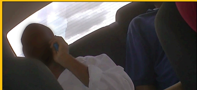
Suspected trafficker speaking with an undercover O.U.R. Operator in a car planning the party.