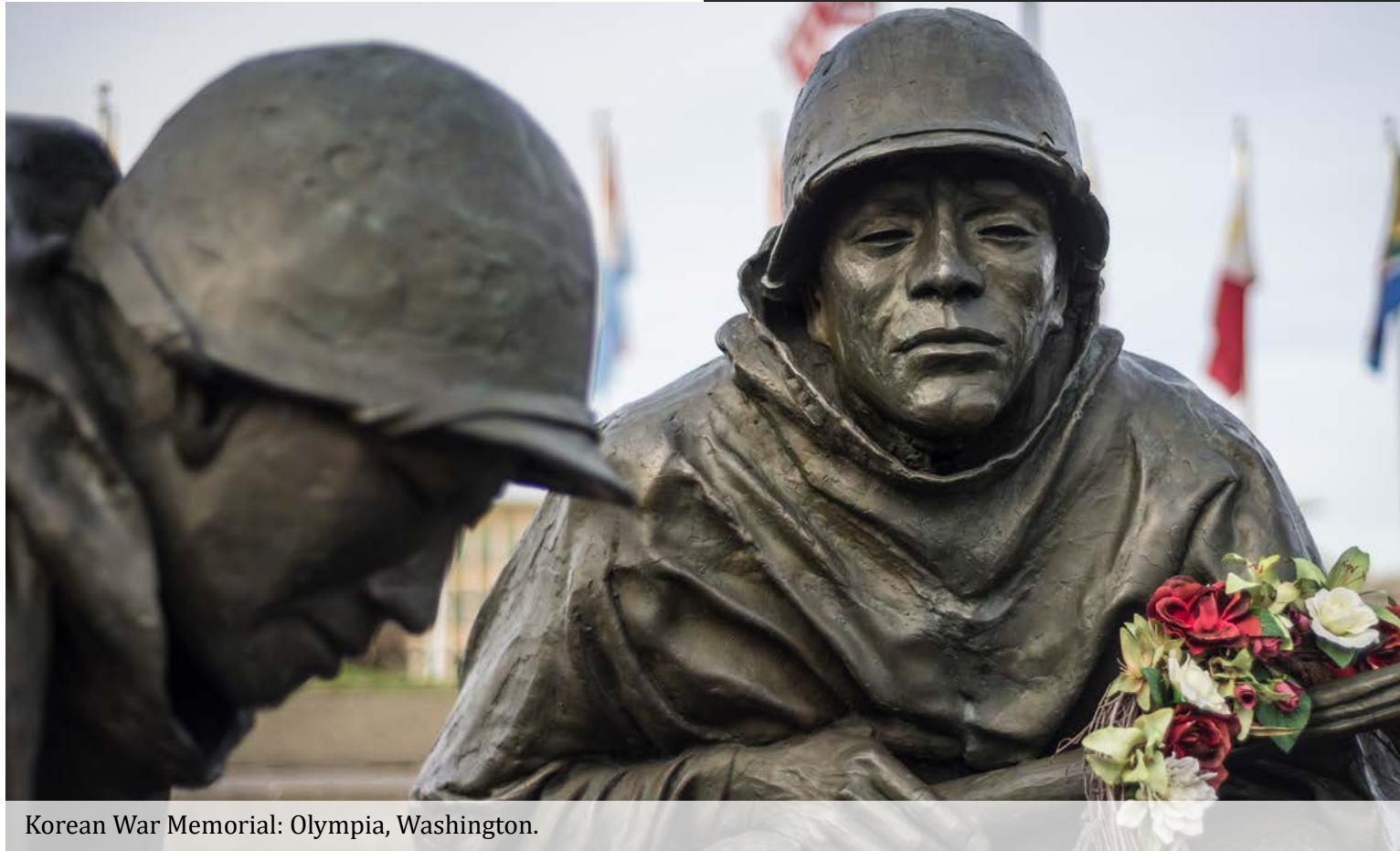
Korean War Memorial: Olympia, Washington.

The Attorney General's Office is proud to support our military service members, veterans, and their families. In 2018 the office filed lawsuits against veteran-related charities that scammed consumers. The office also launched an updated version of its Veterans Resource Guide.