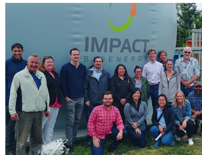
AGO Public Counsel Unit

Legal Highlights: In 2018, Public Counsel represented consumers in major rate cases before the UTC involving Avista, Puget Sound Energy and Cascade Natural Gas. The unit also addressed a utility merger (Hydro One's acquisition of Avista) and the planned sale of a utility's non-majority, ownership shares (Puget Sound Energy's sale of their Macquarie interest). The unit prevailed in its appeal of the UTC's order in Avista's 2015 general rate case in Division II of the Court of Appeals. Public Counsel also represented customers in a complaint matter involving CenturyLink's obligations to provide a line extension and serve a customer requesting service. This case resulted in a rulemaking to evaluate telecommunication companies' obligations as a carrier of last resort in Washington.