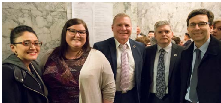
AG Ferguson poses with AGO staff who helped pass legislation that creates an enabling statute for Washington's Medicaid Fraud Control Unit.

Legal Highlights: In 2018, the MFC secured 4 criminal convictions and 14 civil FCA resolutions. The division had two seminal cases. A case against company RTS - the first litigated false claims act matter in Washington state — resulted in a $2.7 million dollar verdict, including full treble damages and a penalty. The division had its first criminal conviction for a care plan violation in a skilled