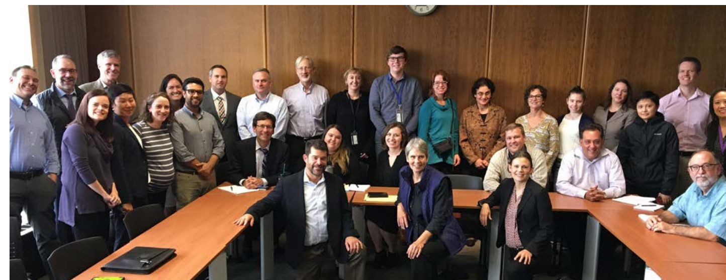
AGO University of Washington Division

Overview: The University of Washington Division provides comprehensive legal services to the University of Washington (UW), which is one of the world's preeminent public universities. The UW maintains three campuses (Seattle, Tacoma, and Bothell), and operates three major hospitals as part of a larger medical enterprise. The UW annually enrolls more than 55,000 undergraduate, graduate, and professional students and employs more than 45,000 faculty, professional exempt staff, civil service staff (union and non-union), and students in academia, health care, administration, research,