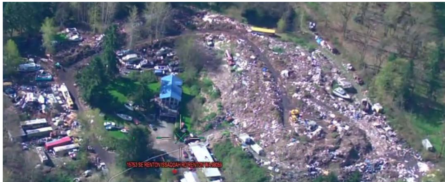
Aerial footage of an illegal dump and wrecking yard in Renton. After the office brought legal action, a King County Superior Court judge found the dump owner guilty of multiple felony charges.