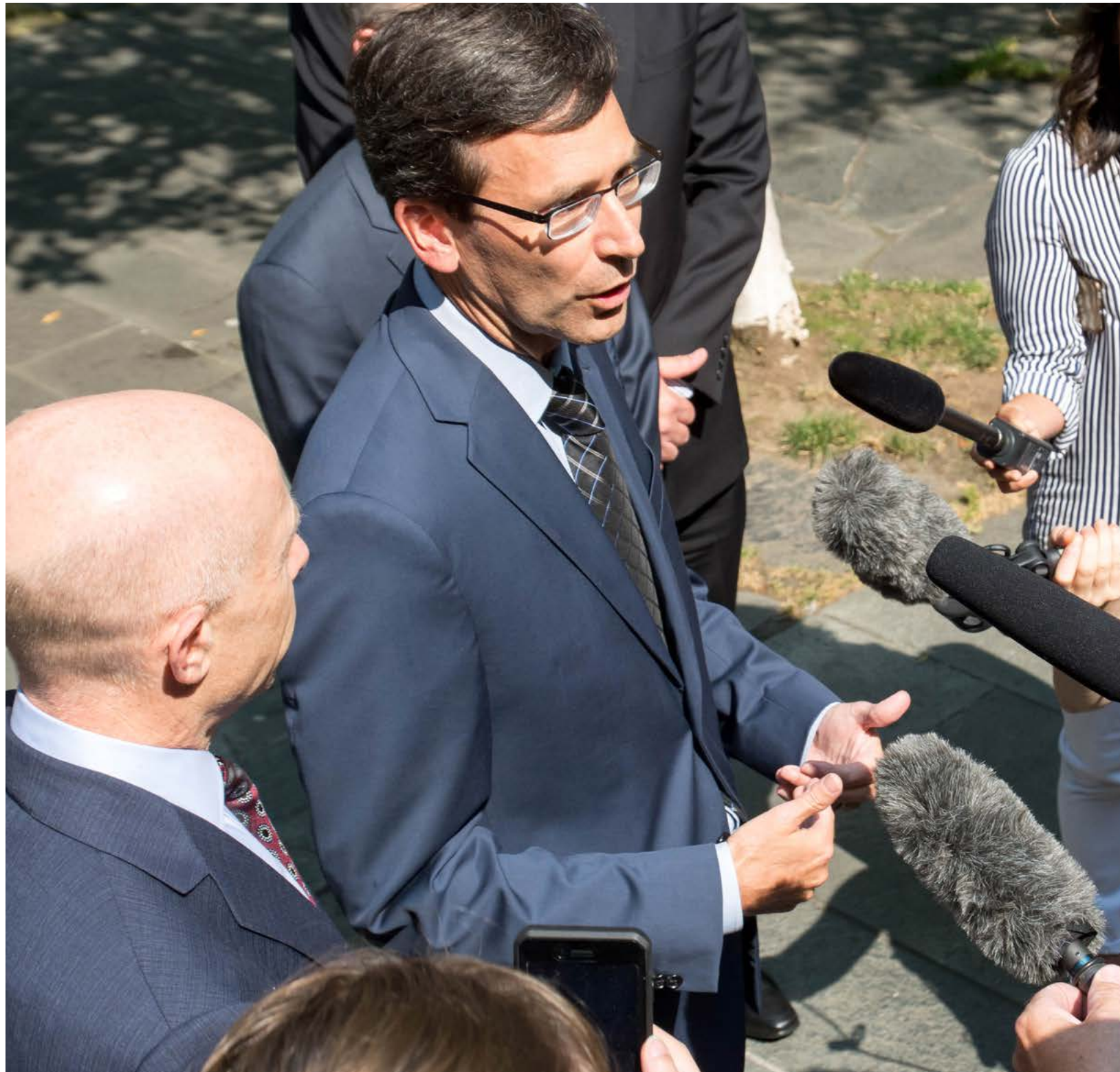
AG Ferguson speaks with media after a hearing in a case challenging the Trump Administration's deregulation of downloadable 3D-printed guns. At the hearing, the office obtained a temporary restraining order (see p. 19 for more information).