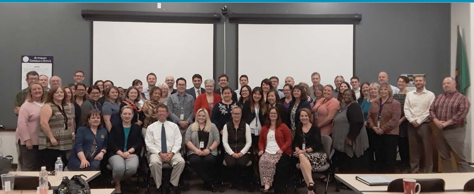
AGO Tacoma Division