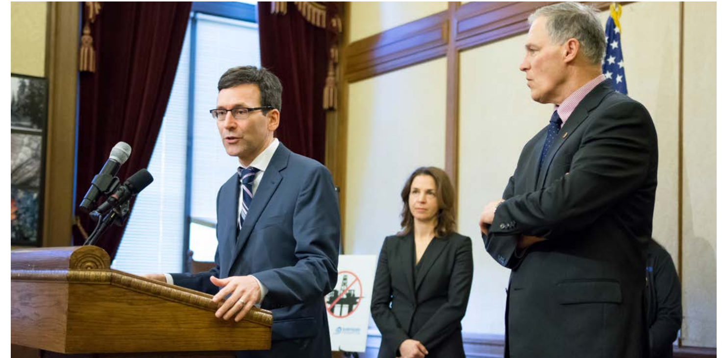
AG Ferguson, joined by Gov. Jay Inslee and Commissioner of Public Lands Hilary Franz, discusses President Donald Trump's proposal to allow oil and gas drilling off Washington's coast.

Protecting Washington's environment continued to be a top priority of the office. The office engaged in a range of actions to protect the environment and hold accountable those who commit environmental crimes. Much of the office's environmental work in 2018 continued to focus on defending federal environmental rules and standards that the Trump Administration has vowed to roll back.