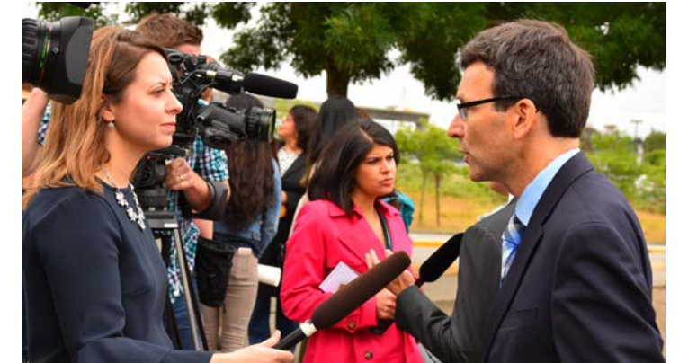
AG Ferguson speaks to media after the office announced its family separation lawsuit.