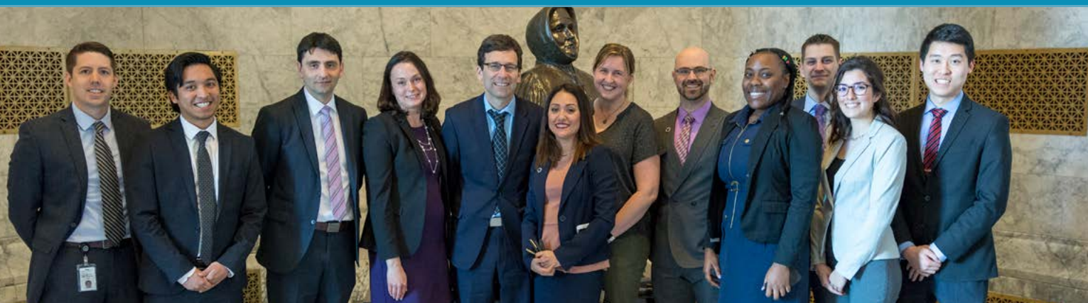
AG Ferguson poses with advocates and AGO staff who helped pass the Student Loan Bill of Rights legislation.