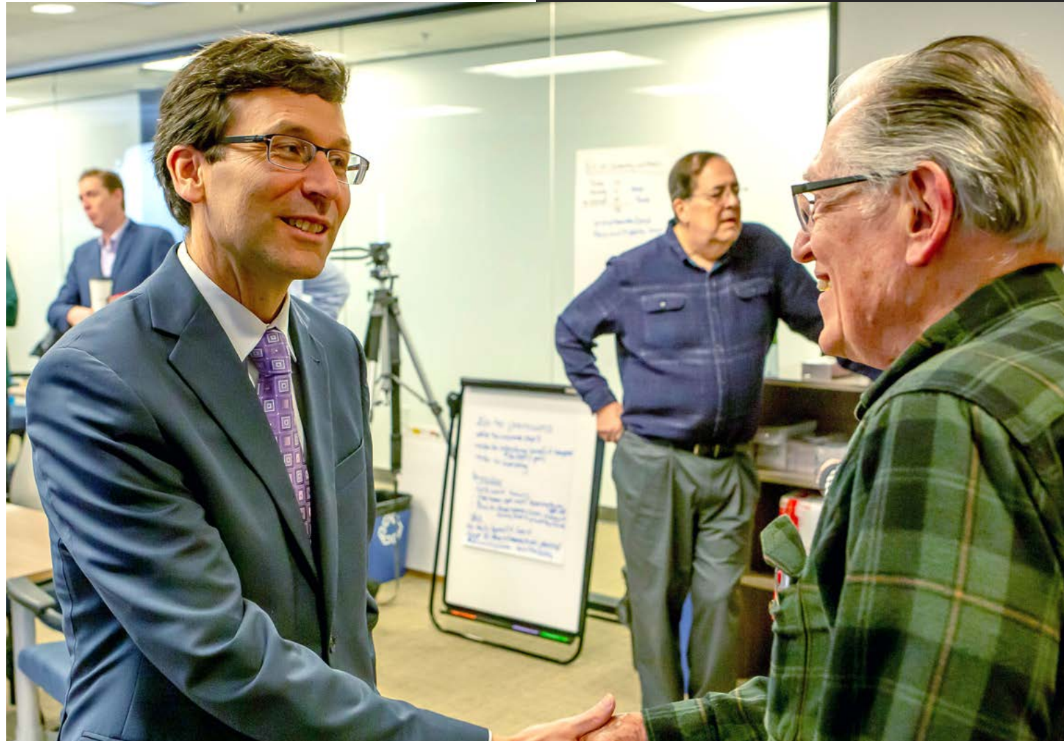
AG Ferguson greets volunteer leaders in the AARP Fraud Fighter program after taping a video on behalf of the program.