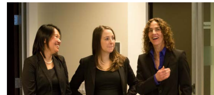
Members of the AGO Consumer Protection Division talk after a press conference.

Legal Highlights: In July 2018, the Antitrust Division announced a first-of-its-kind settlement with seven fast-food franchises requiring them on a nationwide basis to stop enforcing and eliminate provisions in their franchise agreements that prohibit employees from moving among stores in the same corporate chain. Through 2018, the division secured agreements with 46 nationwide franchisors with more than 100,000 locations nationwide, expanded the investigation into new industries and filed the first lawsuit by a state attorney general against a fast-food franchisor for its use of these "no poach" provisions. In addition, the division recovered $39 million from its lawsuit against seven foreign manufacturers of cathode ray tubes (a component of television screens and monitors) for engaging in a wide-ranging price-fixing conspiracy. The division also has continued to litigate its federal lawsuit against CHI Franciscan healthcare system, alleging that it entered into two anticompetitive transactions that have raised healthcare prices and decreased competition for healthcare on the Kitsap Peninsula.