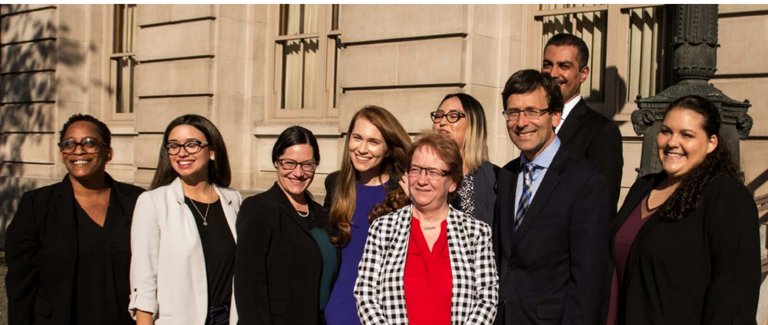
AG Ferguson and staff from the Wing Luke Civil Rights Unit after garnering a $525,000 resolution on behalf of farmworker women who were sexually harassed by the foreman of a Central Washington onion packing plant.