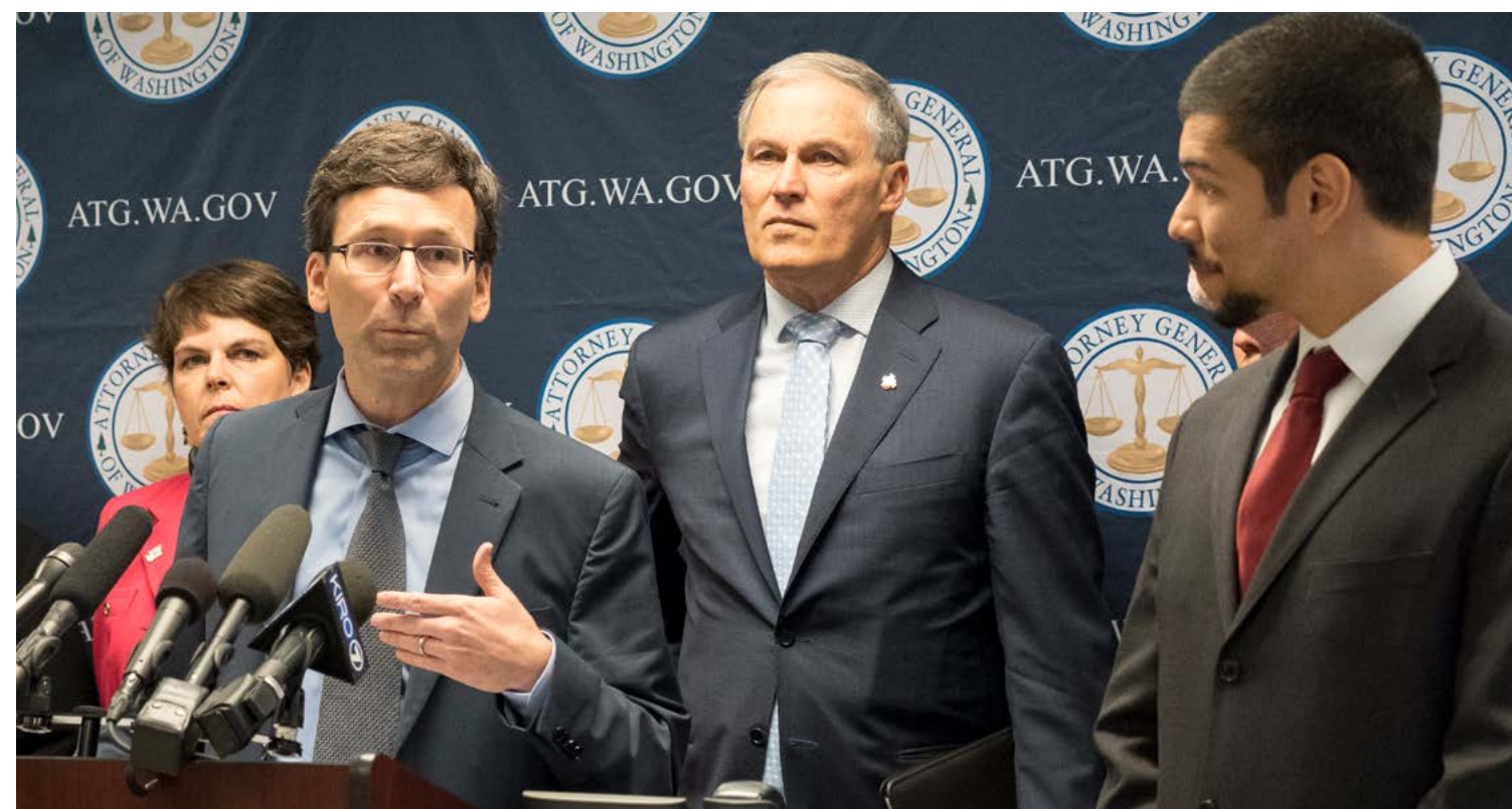
AG Ferguson discusses a lawsuit the federal government filed against Washington over a state law that makes it easier for Hanford Nuclear Reservation workers to access the benefits they deserve if they become ill due to their work.

Legal Highlights: Interest arbitrations are hearings in which an employer and employee union present cases to an arbitrator to resolve disputes over the final terms of a collective bargaining agreement. In 2018, the division handled seven interest arbitration hearings to settle the contract terms for the 2019-2021 state collective bargaining agreements. Another 12 union contracts eligible for interest arbitration reached agreement on contract terms just prior to hearing. The division served as the primary AGO resource after the U.S. Supreme Court's decision in Janus v. AFSCME Council 31 , issued on June 27, 2018, which held that the U.S. Constitution prohibits public employers and unions from entering into agreements that require bargaining unit members to pay an agency fee or a representation fee. The division also has been involved in defending the state in multiple lawsuits relating to exclusive bargaining