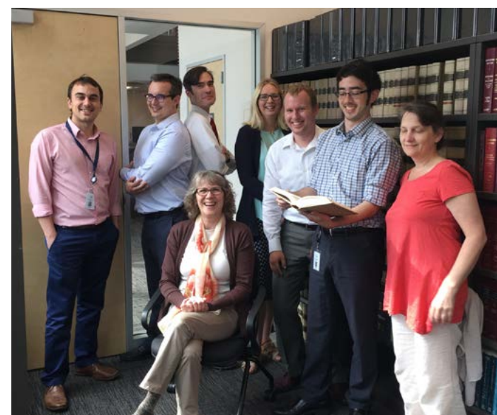
AGO Utilities and Transportation Division

Legal Highlights: In 2018, the division advised and represented the UTC in energy rate cases brought by Puget Sound Energy, PacifiCorp, Avista Corporation and Cascade Natural Gas. 2018 brought Avista's proposed merger with Hydro One and Puget Sound Energy's proposed acquisition by Alberta Investment Management Corporation, British Columbia Investment Management Corporation, OMERS Administration Corporation and PGGM Vermögensbeher B.V.