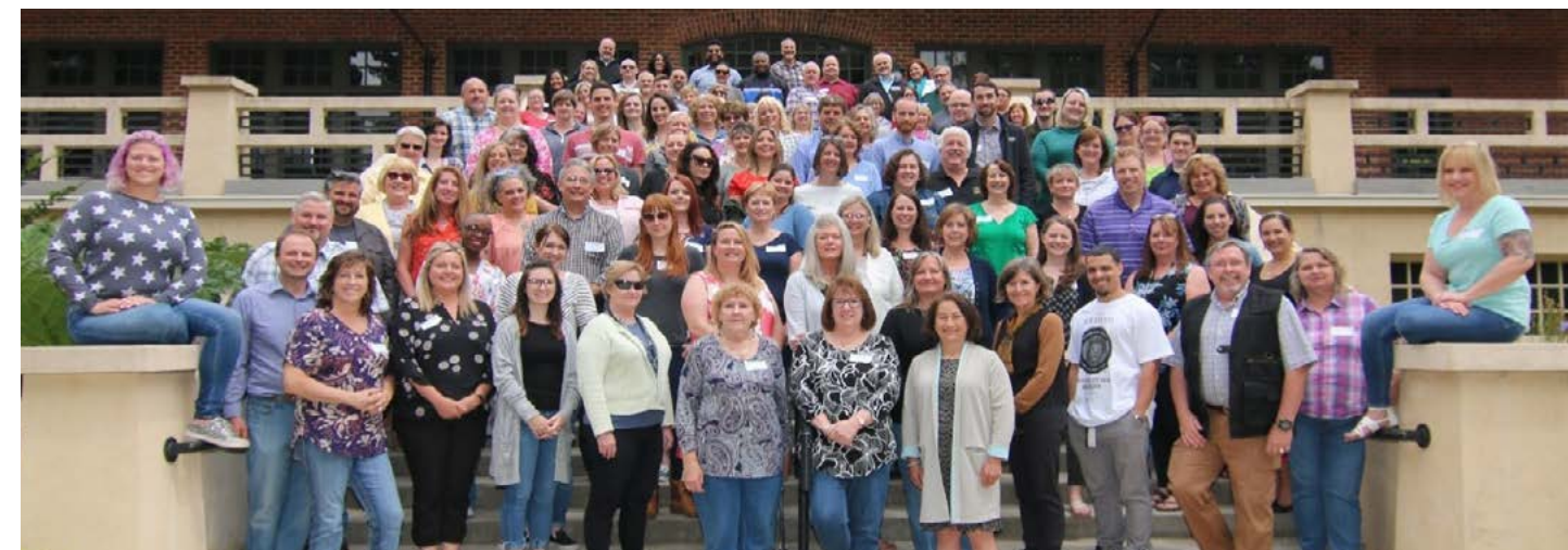
AGO Torts Division

Legal Highlights: BCU collected a total of $4,822,827.03 for its clients in 2018. Contributions of $2,474,389.82 came from the contractor bond program in which 515 cases were opened, primarily to collect delinquent taxes owed to the Departments of Revenue, Labor & Industries and Employment Security. The unit also opened 169 bankruptcy files, primarily for cases under Chapters 11 and 13, recovering $1,544,355.35 for client agencies. The unit's participation in 95 other legal cases resulted in recoveries totaling $804,081.86.