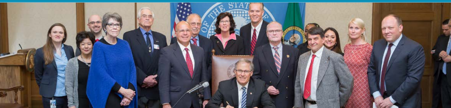
Governor Inslee signs the AG-request SVP Unconditional Release Statutory Fix bill into law.