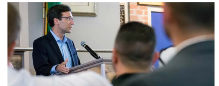
AG Ferguson speaks with Hanford workers at a town hall in the Tri-Cities.

On Sept. 19, the office announced that Energy will conduct testing and, if successful, begin implementing a new system to treat or capture hazardous tank vapors at Hanford within the next three years, under the terms of an agreement submitted to a federal court. The resolution also required Energy to pay Washington state and nonprofit watchdog and advocacy organization Hanford Challenge $925,000.