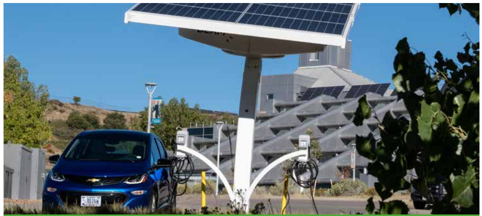
Figure 1. Fleets can choose from a wide variety of electric vehicles available for light-, medium-, and heavy-duty applications.

Performance Features. EVs are much quieter than conventional vehicles. They produce maximum torque and smooth acceleration from a full stop, which can be especially useful when hauling heavy loads.