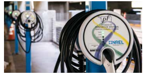
Figure 3. Networked charging systems provide detailed energy use data and the ability to schedule charging events to take advantage of off-peak electric rates.

Many light-duty vehicles are available for fleet applications. Although some new models are limited to certain states, many are or will soon be available nationwide. MD/HD vehicles are also available for many fleet applications. In addition to federal and