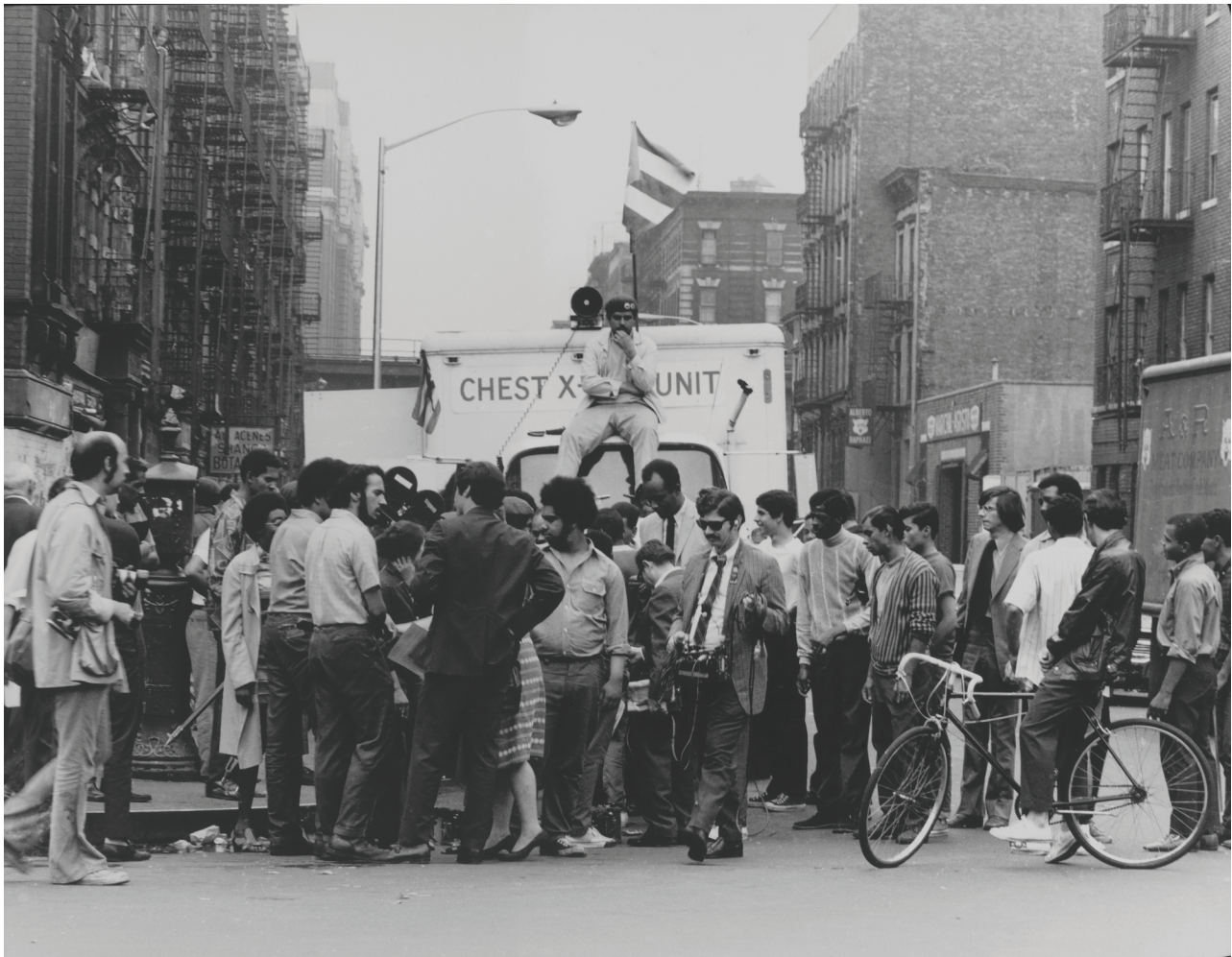
X-Ray Truck II , Hiram Maristany, 1970, courtesy of the photographer

POWER TO ALL OPPRESSED PEOPLE: The Young Lords in New York, 1969-1976