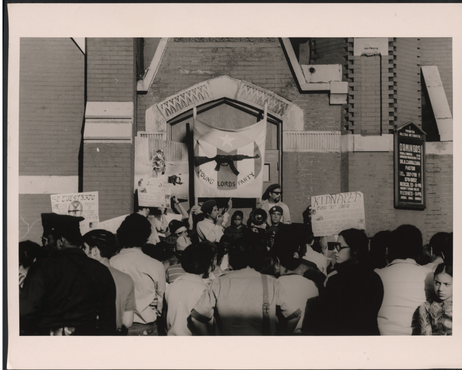
First People's Church, Hiram Maristany, 1970, courtesy of the photographer