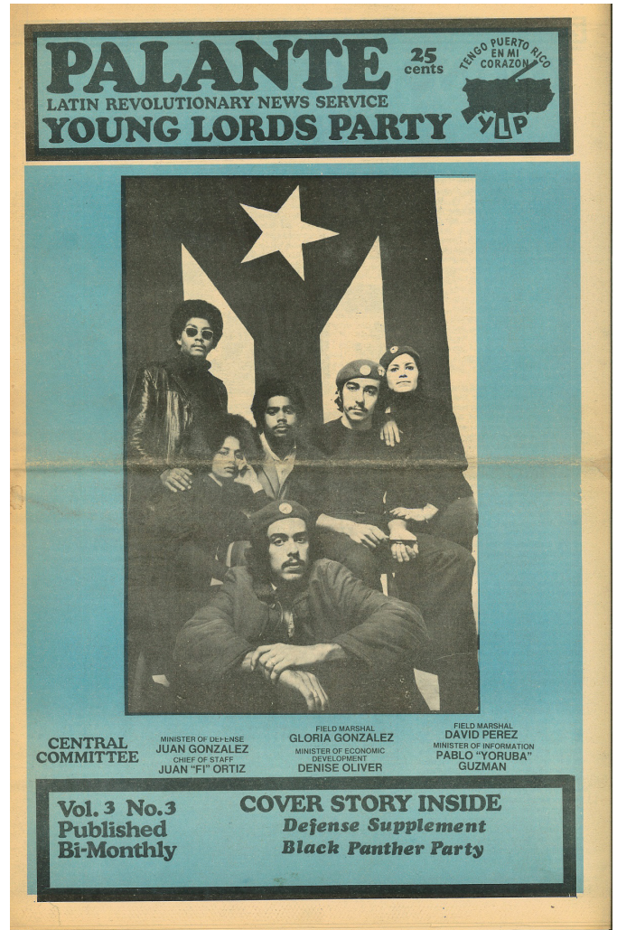
Palante, Vol. 3, No. 3, February 1971