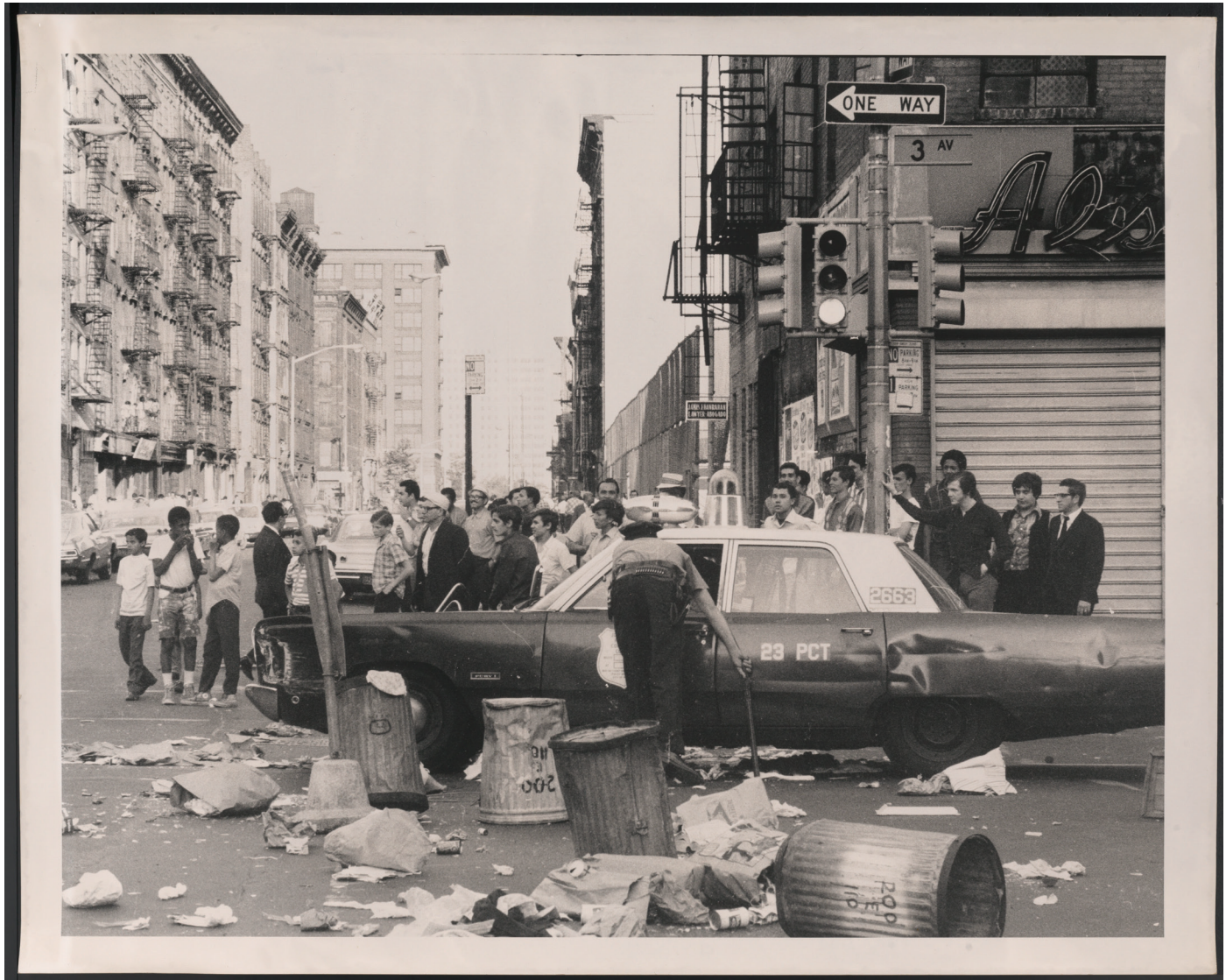
Garbage Offensive—Summer/Fall 1969, Hiram Maristany, 1969, courtesy of the photographer

POWER TO ALL OPPRESSED PEOPLE: The Young Lords in New York, 1969-1976