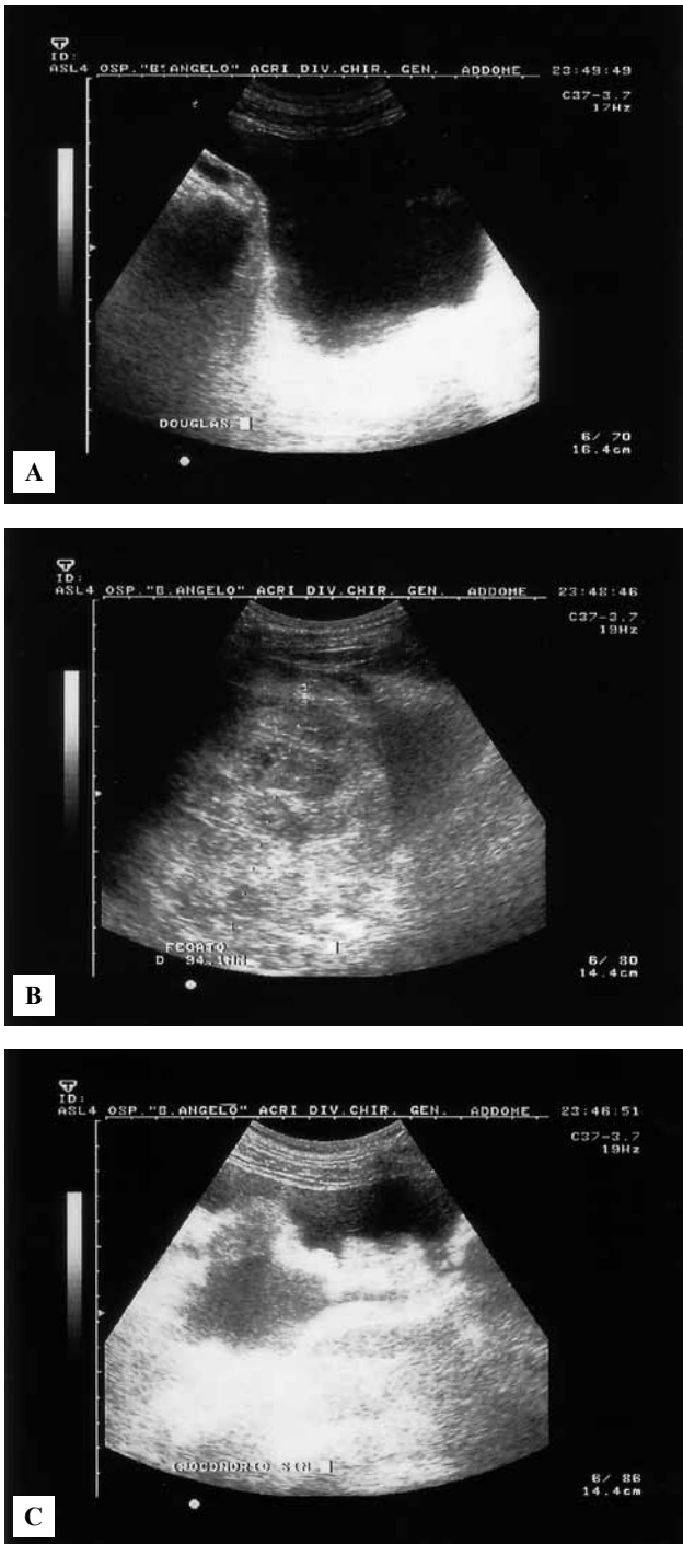
Fig. 1: US reveals hemoperitoneum

point it is necessary to address the therapeutic approaches. In patients with good liver function (Child-Pugh A–B7), the treatment of choice is liver resection. Otherwise, arterial embolization (TAE) (8, 11, 12), is preferable in patients with advanced liver disease, poor functional hepatic reserve, or unresectable HCC. In this case the patient, before the rup-