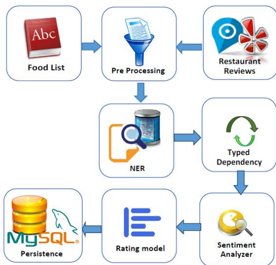
Figure 1: Overall system architecture

A NER system preceded by a pre-processing step was used to extract food names from customer reviews. This NER system is particularly trained for food domain using our food list. Opinion word associated with each food item is determined using a typed dependency parser, and phrases that contain only one subject (i.e. a food item) are created. Sentiment analysis tool in the StanfordNLP toolkit is used for sentiment analysis. We used a modified version of Suresh et al. (2014)'s ranking algorithm for rating food items using the sentiment scores. Calculated ratings for the individual food items are finally saved in a persistent storage.