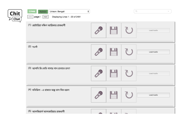
Figure 1: Screenshot of ChitChat UI.

loaded to the server or stored locally for later uploading. A sample screenshot of the ChitChat UI is shown in Figure 1.