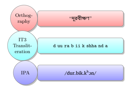
Figure 2: Transcriptions for Bangla word for telescope.

Consider the Bangla word for telescope , which is transcribed in IT3 transliteration (Prahallad et al., 2012)