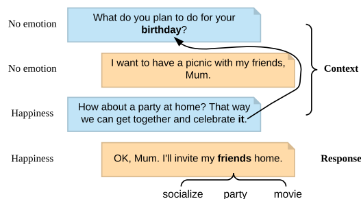
Figure 1: An example conversation with annotated labels from the DailyDialog dataset (Li et al., 2017). By referring to the context, “it” in the third utterance is linked to “birthday” in the first utterance. By leveraging an external knowledge base, the meaning of “friends” in the fourth utterance is enriched by associated knowledge entities, namely “socialize”, “party”, and “movie”. Thus, the implicit “happiness” emotion in the fourth utterance can be inferred more easily via its enriched meaning.

Emotions are “generated states in humans that reflect evaluative judgments of the environment, the self and other social agents” (Hudlicka, 2011). Messages in human communications inherently convey emotions. With the prevalence of social media platforms such as Facebook Messenger, as well as conversational agents such as Amazon Alexa, there is an emerging need for machines to understand human emotions in natural conversations. This work addresses the task of detecting emotions (e.g., happy, sad, angry, etc.) in textual conversations, where the emotion of an utterance is detected in the conversational context. Being able to effectively detect emotions in conversations leads to a wide range of applications ranging from opinion mining in social media platforms