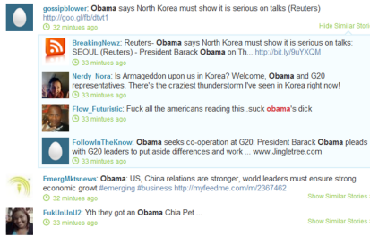
Figure 2: An example of summarization of Twitter search results about “Obama”.

30 th 2010. Then for each query in DS_U , results from Twitter search and our system are displayed side by side, and 3 users 11 are asked to choose which is better. For each user, we record how many queries our system is voted to be better. The inter-rater agreement 12 between users is also computed. Table 6 shows the results, suggesting that users tend to be more satisfied with our system. The inter-rater agreement is 0.74, indicating that users are more likely to agree with each other. Note that the values in the “Votes for ours” column are computed using Formula 18, where Q_{it} denotes the queries for which the user u \in \{A, B, C\} believes our system gives better results than Twitter search, and Q denotes all queries in