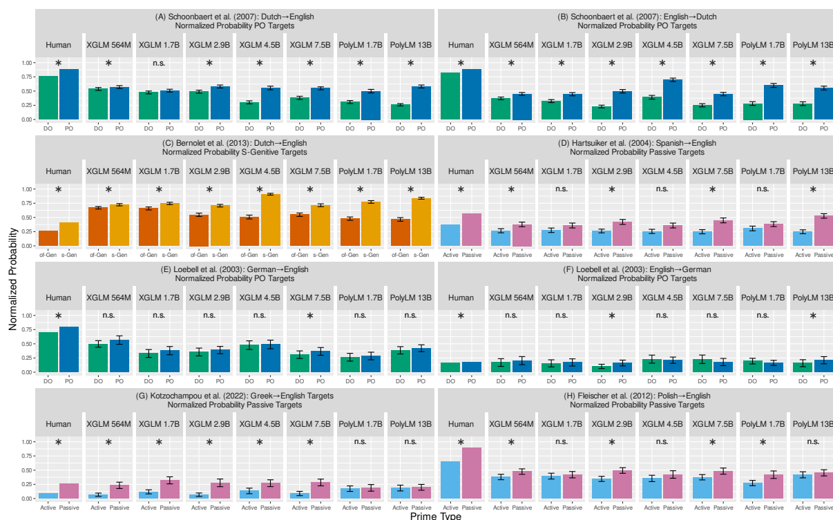
Figure 1: Human and language model results for crosslingual structural priming experiments.