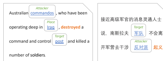
Figure 1: An illustration of cross-lingual event argument extraction. Given sentences in arbitrary languages and their event triggers ( destroyed and 起义), the model needs to identify arguments ( commando , Iraq and post v.s. 军队, and 反对派) and their corresponding roles ( Attacker , Target , and Place ).

Zero-shot cross-lingual EAE has attracted considerable attention since it eliminates the requirement of labeled data for constructing EAE models in low-resource languages (Subburathinam et al., 2019; Ahmad et al., 2021; Nguyen and Nguyen,