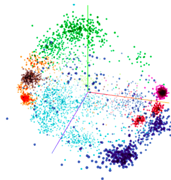
Figure 5: Clustering of NRC-EmoLex lexicons using VAD-dimension + Plutchik emotion embeddings after step-2 processing

5.4k examples and TEC dataset with 20k examples respectively used for training and testing.