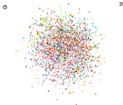
Figure 3: Visualization of NRC-EmoLex lexicons using GloVe-300d embeddings