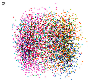
Figure 4: Visualization of NRC-EmoLex lexicons using VAD-Append embeddings after step-1 processing