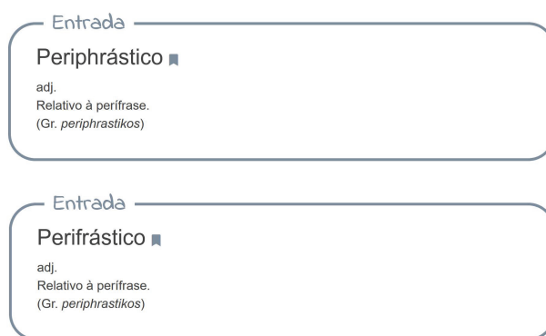
Figure 2: perifrástico [periphrastic] and perifrástico [periphrastic] in DA

For this task, we have ignored the old orthographic variant forms of a given lexical unit, as they are present in duplicate in DA (with an updated version of the form). Since the DLPC is a contemporary dictionary, these orthographic