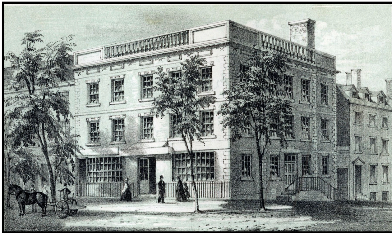
Samuel Osgood's house at 1 Cherry Street in New York served as the first Presidential Mansion. George Washington lived there from April 23, 1789, until February 23, 1790.