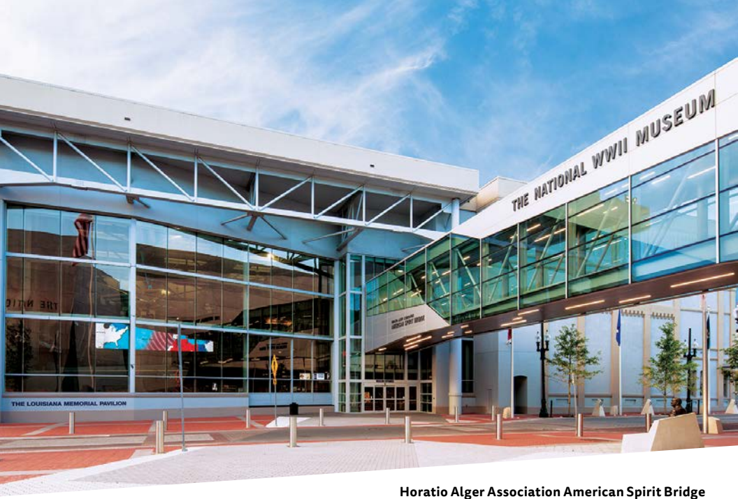
Horatio Alger Association American Spirit Bridge