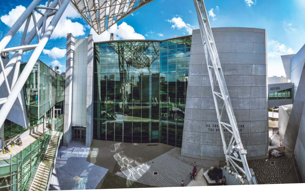
Col. Battle Barksdale Parade Ground