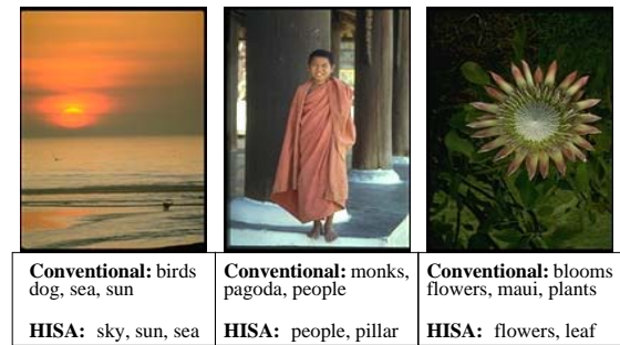
Figure 4: Generic annotation words used by HISA vs. conventional keywords from the image source

We construct the ontology using the keyword set, the common-sense knowledge, and the domain knowledge. The keyword set K generated from the annotation is used for the ontology analysis. The annotation words used by HISA are different from the conventional image annotation which we obtained from the image source (described as above). Figure 4 shows the difference between them. We apply a