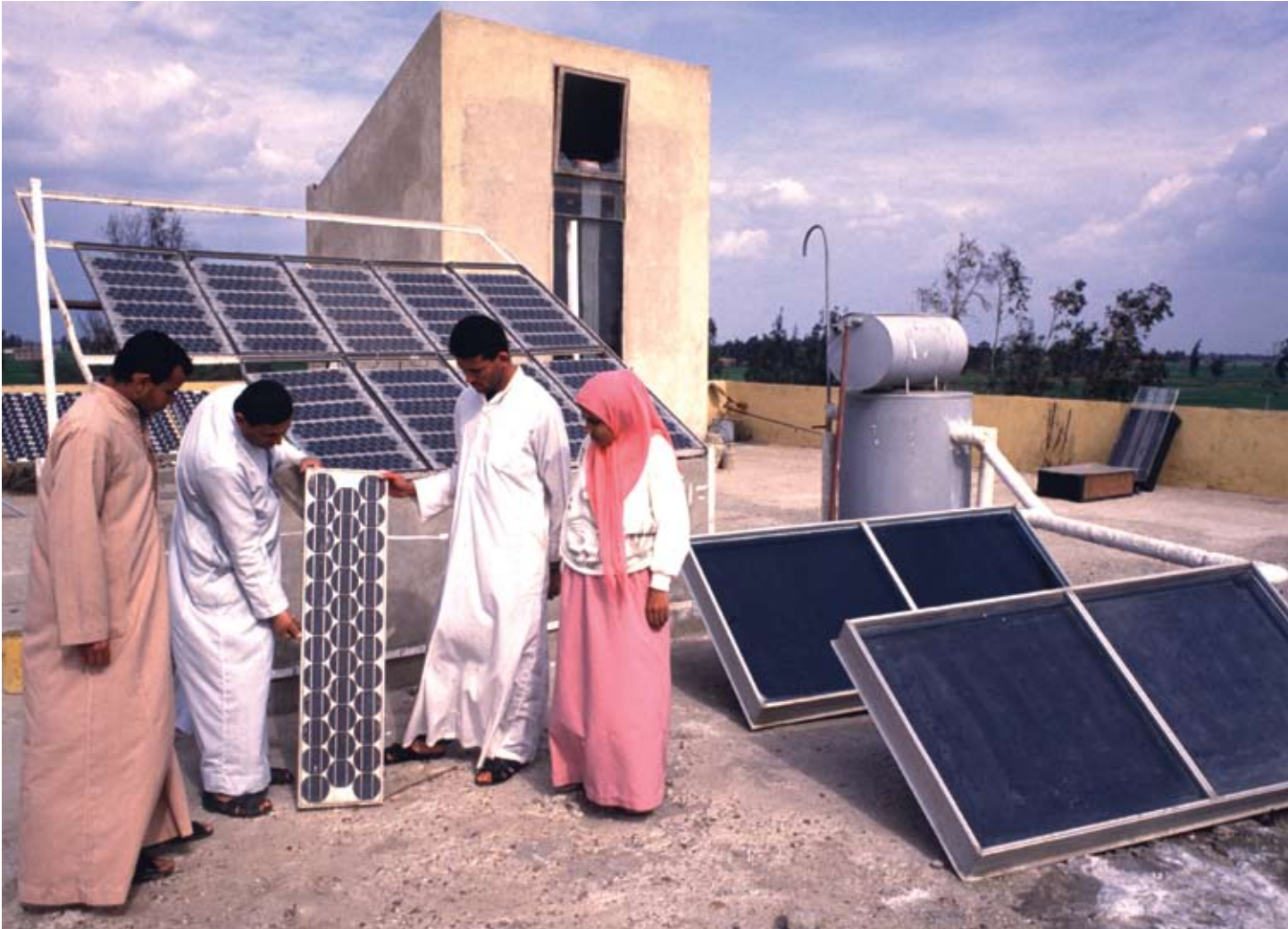
Jorgen Schytte/UNDP (Egypt)

At the same time, the table indicates that many risk screening tools take a broad range of mainstreaming aspects into account at the level at which they operate, although it should be noted that the table does not indicate how detailed the assessment of each mainstreaming aspect is. The results and experiences from the risk screening tools may therefore provide valuable information, as well as represent vehicles to support the wider process of mainstreaming across various levels and go beyond simply climate risk screening.