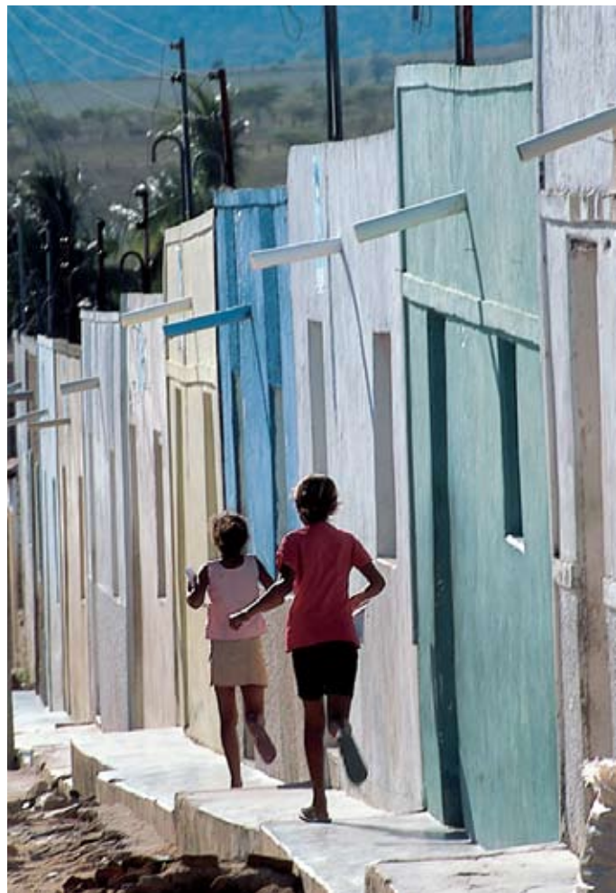
Tina Coelho/UNDP (Brazil)

The Adaptation Policy Frameworks for climate change (APF) developed by UNDP on behalf of the Global Environment Facility, is a roadmap for program/project planners and policy makers, to support them in formulating and implementing adaptation activities, policies and strategies, as well as enabling the inclusion of adaptation considerations in existing programmes and projects.