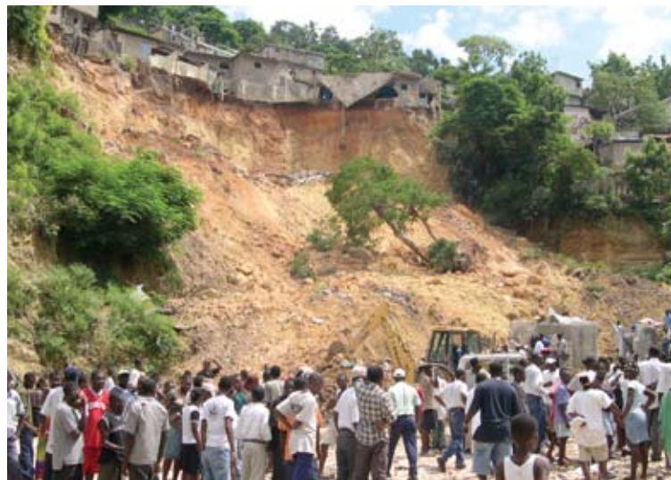
Michel Matera/UNDP (Haiti)

How can we distinguish between climate risk management and mainstreaming, as defined in the first paragraph of this document? Climate risk management is a generic term used to refer to an approach to promote sustainable development by reducing the vulnerability associated with climate risk (ADB 2009). According to the IPCC (2007a, p.64), “responding to climate change involves an iterative risk management process that includes both mitigation and adaptation, taking into account actual and avoided climate change damages, co-benefits, sustainability, equity and attitudes to risk. Risk management techniques can explicitly accommodate sectoral, regional and temporal diversity, but their application requires information about not only impacts resulting from the most likely climate scenarios, but also impacts arising from lower-probability but higher-consequence events and the consequences of proposed policies and measures”. Again the most prominent distinguishing feature seems to be the extent to which the driver of the approach is development or climate change.