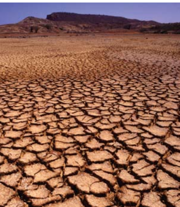
Evan Schneider/UNDP (Senegal)

intends to cover all aspects of mainstreaming at all levels are, by definition, placed at the other end of the continuum (OECD guidance), and aim at establishing a framework for mainstreaming intended to support and guide policy and planning processes.