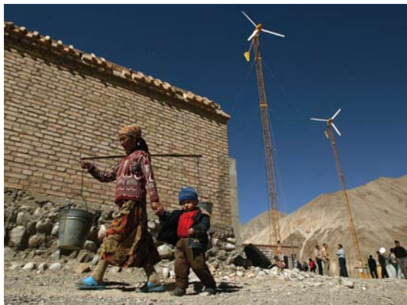
Stephen Shaver/Bloomberg News (China)

The detailed climate risk assessment leads to the identification of adaptation options (fourth item on our generic list) and prioritization and selection of adaptation options (fifth item). At the national and sectoral level, this corresponds to the inclusion of adaptation-specific programmes and projects as well as the inclusion of cross-sectoral and sectoral top-down adaptation activities.