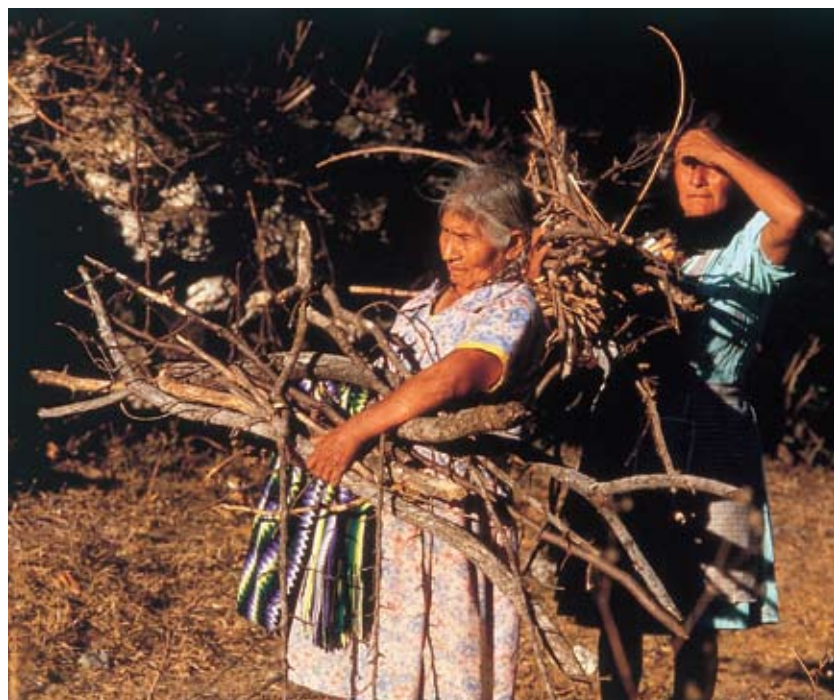
Liba Taylor/UNDP (Bolivia)

In addition, certain tools and exercises – notably the UNDP APF and CRiSTAL – are firmly rooted in a climate change adaptation context and have a predominant focus on developing relevant adaptation options, measures and policies, without starting from the premise of ongoing or planned development activities. By contrast, others (e.g. Danida and ADB) focus primarily on providing an overview of key vulnerabilities and climate adaptation needs in different sectors and communities within a given country, and aim at outlining necessary adjustments to existing and future programs and projects.