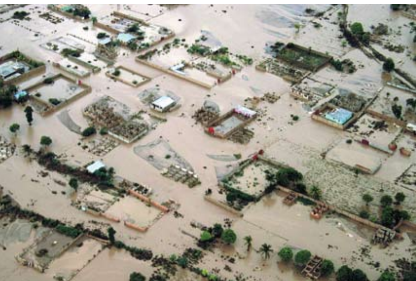
Sophia Paris/UNDP (Haiti)