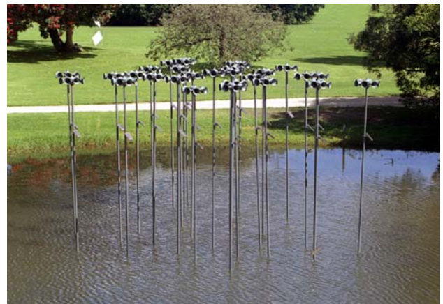
Figure 6. Nigel Helyer, “MetaDiva”, Werribee Park, 2002 Permanent outdoor sculpture and winner of the Helen Lempriere prize.

www.sounddesign.unimelb.edu.au/web/biogs/P000295b.htm