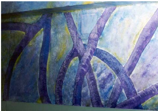
Figure 5. Peter Mumme, “Cairns International Airport Sound Experience”, speaker picture

www.sounddesign.unimelb.edu.au/web/mumme/cairns2.mp3