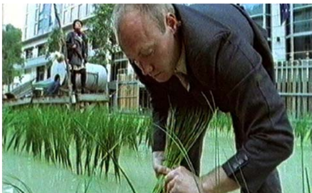
Figure 1. Roger Alsop and collaborators, "Rice Paddies", 2001