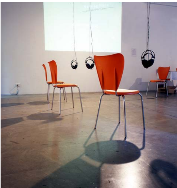
Figure 3. The Australian Sound Design Project, Hearing Place, International Audiotheque, March 2003, Photo: Iain Mott

The audiotheque at the VCA gallery brought together some 59 artists from 13 countries with sound works spanning classic electro-acoustic and soundscape composition to pure unedited field recordings. Many of the works utilised 'binaural' recording techniques which when listened to with headphones, immerse the listener in a 3-dimensional sound space. Much thought was given to the spatial and temporal design of the audiotheque so that it would be a pleasant listening experience but be content rich. Over seven hours of audio were presented at a group listening station with seating positioned under 8 sets of suspended headphones. This offered a chance for 8 people to share a common listening sequence at the same time.