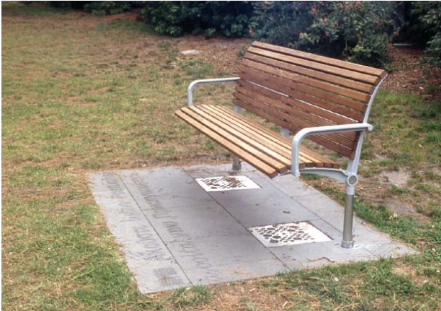
Figure 8. Bandt, Ros, The Listening Place , 2003, Alma Park.