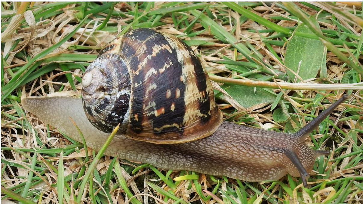
Figure 1. Cornu aspersum , the common garden snail.

If you grew up in a temperate climate, you probably spent some time bothering brown garden snails ( Cornu aspersum , formerly known as Helix aspersa ; Figure 1) or some closely related species of pulmonate (air-breathing) gastropod. Their brains are quite different from and smaller than those of vertebrates, but their behavior is in some ways strikingly complex. They constitute a difficult and interesting case about which different theories yield divergent judgments.