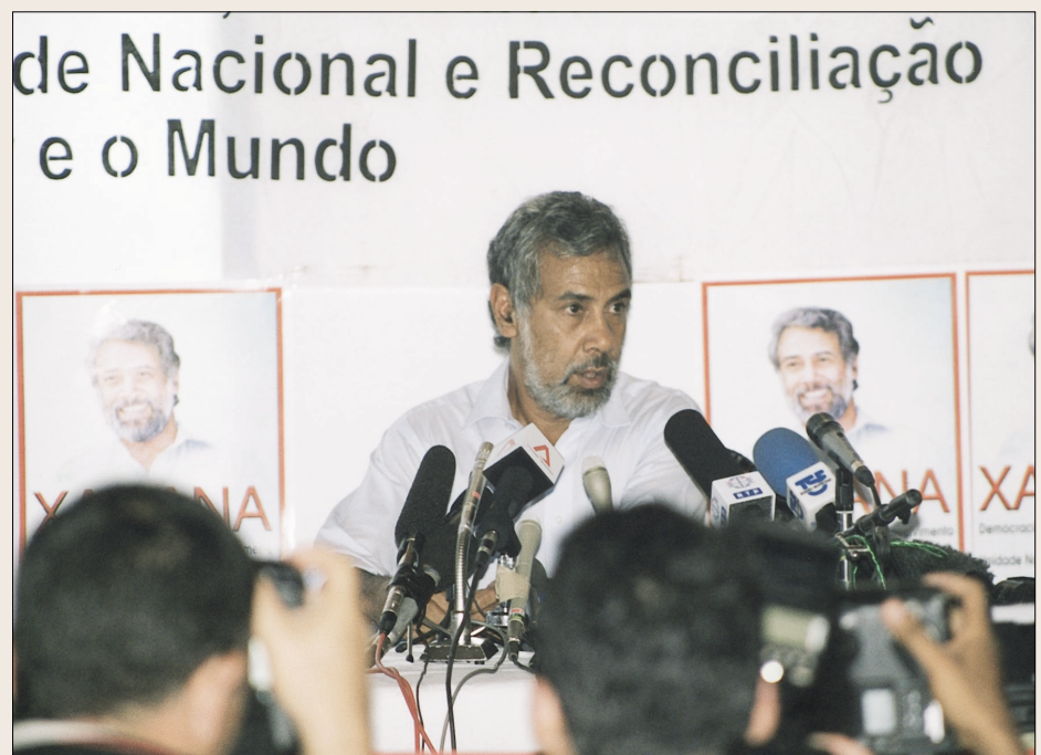
Alexandre "Xanana" Gusmão delivers his acceptance speech after the results of East Timor's presidential election were announced, with 82 percent of the vote in his favor.