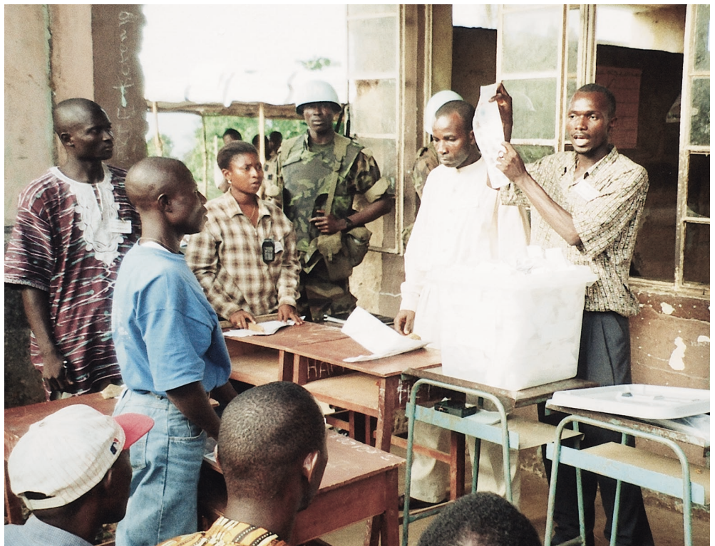
With a U.N. peacekeeping official looking on, an election official displays a ballot so political party agents can confirm it is being counted for the correct candidate.

Turnout for that vote was far less than the 2.2 million who cast votes in the first round. Still, tabulating the runoff votes was a lengthy and questionable process. “The conduct of the elections during the second round was much improved, and the tabulation process was less complicated with only two candidates,” Pottie said.