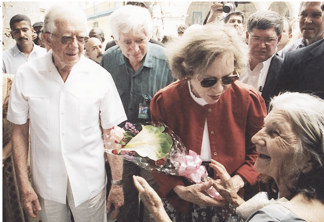
President and Mrs. Carter enjoyed a warm welcome from Cuban citizens during a walking tour of historic Old Havana.