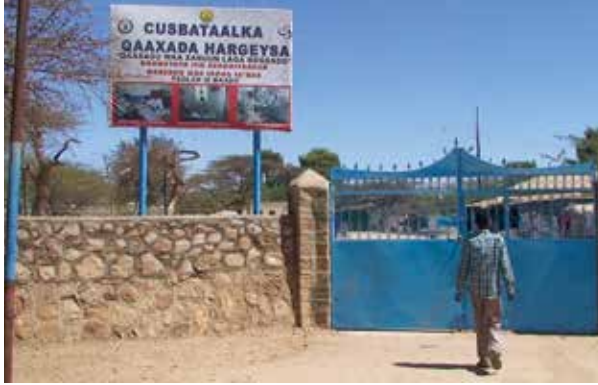
Ismael (17 years old) - Somalia