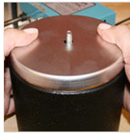
Step 8 Press the outer lid down until it is firmly resting on the outer lip of the barrel.