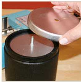
Step 7 Put the outer lid on.