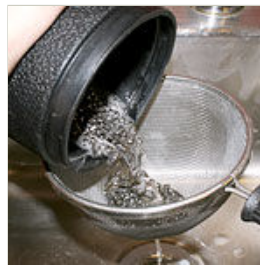
Step 14 Pour all of the contents into a fine mesh strainer.