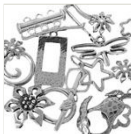
Step 17 Your findings are now clean and polished!