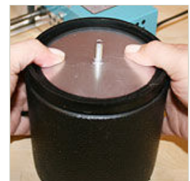
Step 6 Press the inner lid down until it is firmly resting on the inner lip of the barrel.