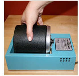
Step 12 Place the barrel on the tumbler. Plug the tumbler in. Tumble for 15-30 minutes.