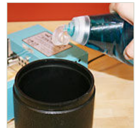
Step 3 Pour in 2-3 drops of Dawn dish detergent - original.