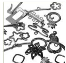
Findings before being polished