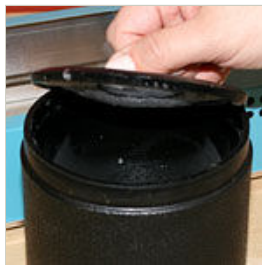
Step 13 Once finished, unplug the tumbler. Unscrew the nut. Remove the washer. Remove the outer and inner lid.