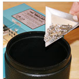
Step 2 Pour in several tarnished findings.