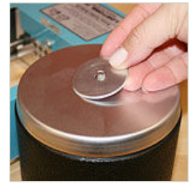
Step 9 Place the washer on the bolt.