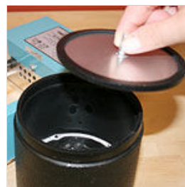
Step 5 Put the inner lid on.