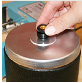
Step 10 Screw the nut down onto the bolt.