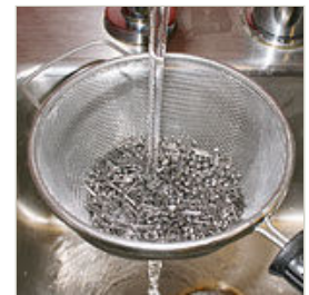
Step 15 Rinse well.