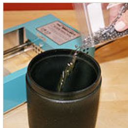
Step 1 Fill the barrel of the tumbler with about a pound of stainless steel shot.

Tip: Do not tumble jewelry containing stones. The steel shot may damage the stones.