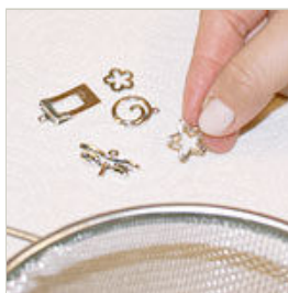
Step 16 Pick out the findings and dry them off completely. Let the stainless steel shot dry completely before storing.