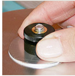
Step 11 Tighten the nut until a little of the bolt shows. Do not over tighten.