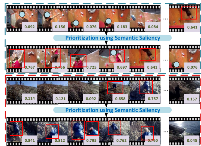
Figure 1. Two Internet video examples, where the same event Rock Climbing happened in very different time frames. The number in each frame indicates its saliency score, which describes how this keyframe is relevant to the specified event. We use this saliency information to prioritize the video shot representations.

Modern consumer electronics ( e.g. smart phones) have made video acquisition convenient for the general public. Consequently, the number of videos on Internet has grown at an unprecedented rate, thanks also to the appearance of large video hosting websites ( e.g. YouTube). How to store, index, classify, and eventually make sense of the vast information contained in these videos has become an important challenge for the machine learning and computer vi-