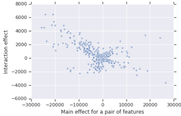
Figure 1: A plot of main effects of pairs of features vs interaction effect for the pair. Negative slope indicates substitutes.