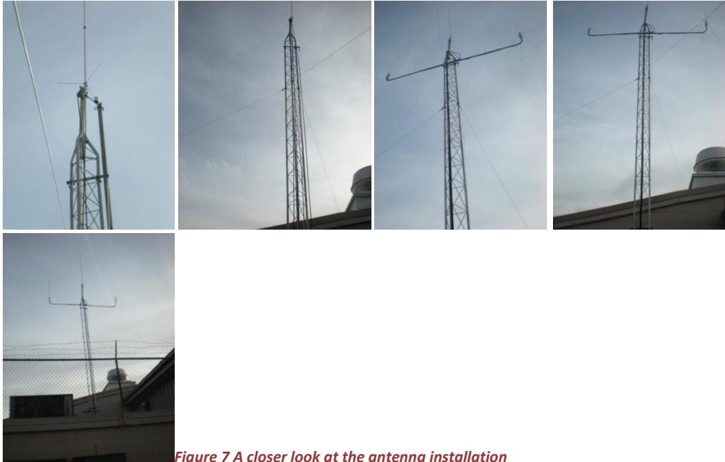
Figure 7 A closer look at the antenna installation