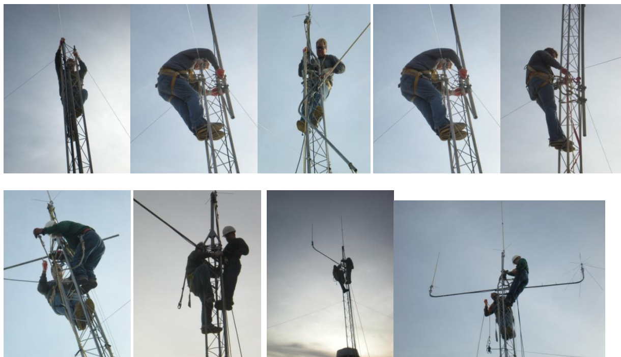
Figure 5 George WBØCNK joins Brian on the tower