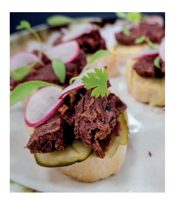
Menu & prices valid until 24th November 2024