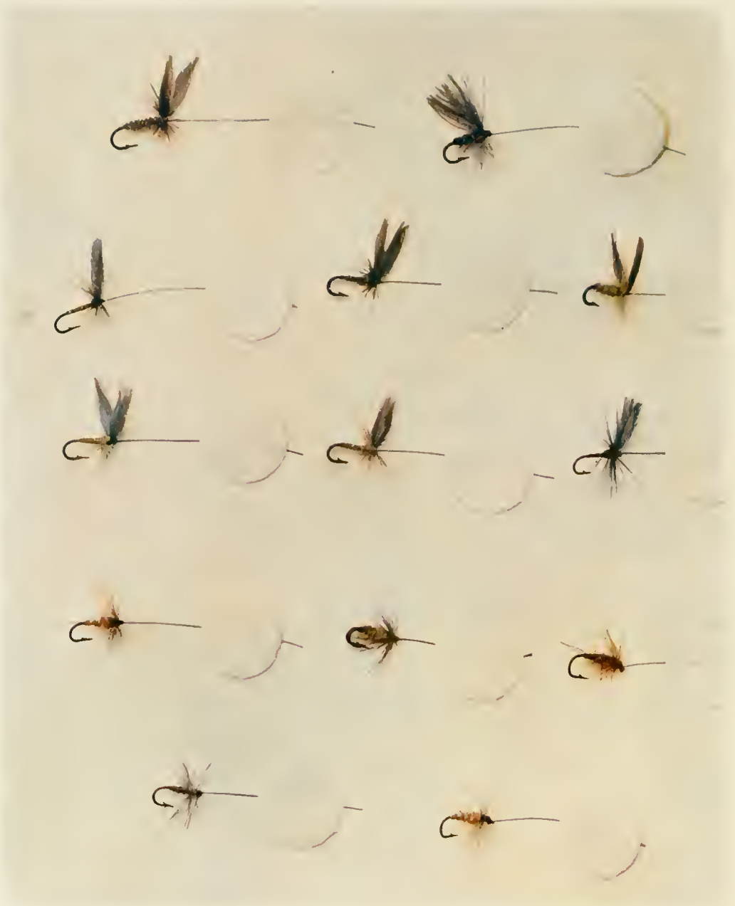
ROUGH SPRING OLIVE. No. 1.