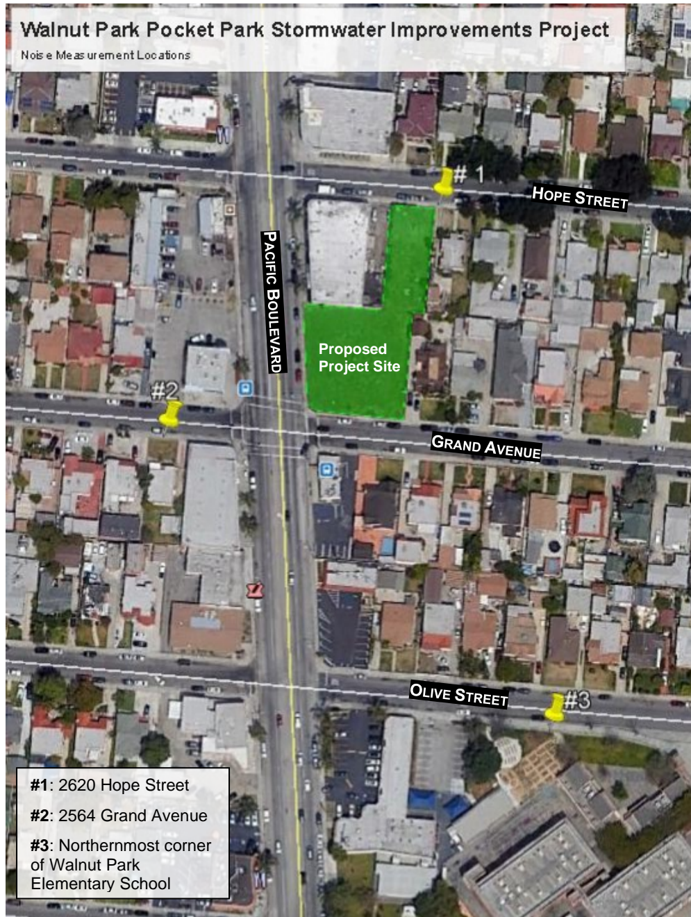
Figure 3-1. Sound Measurement Locations