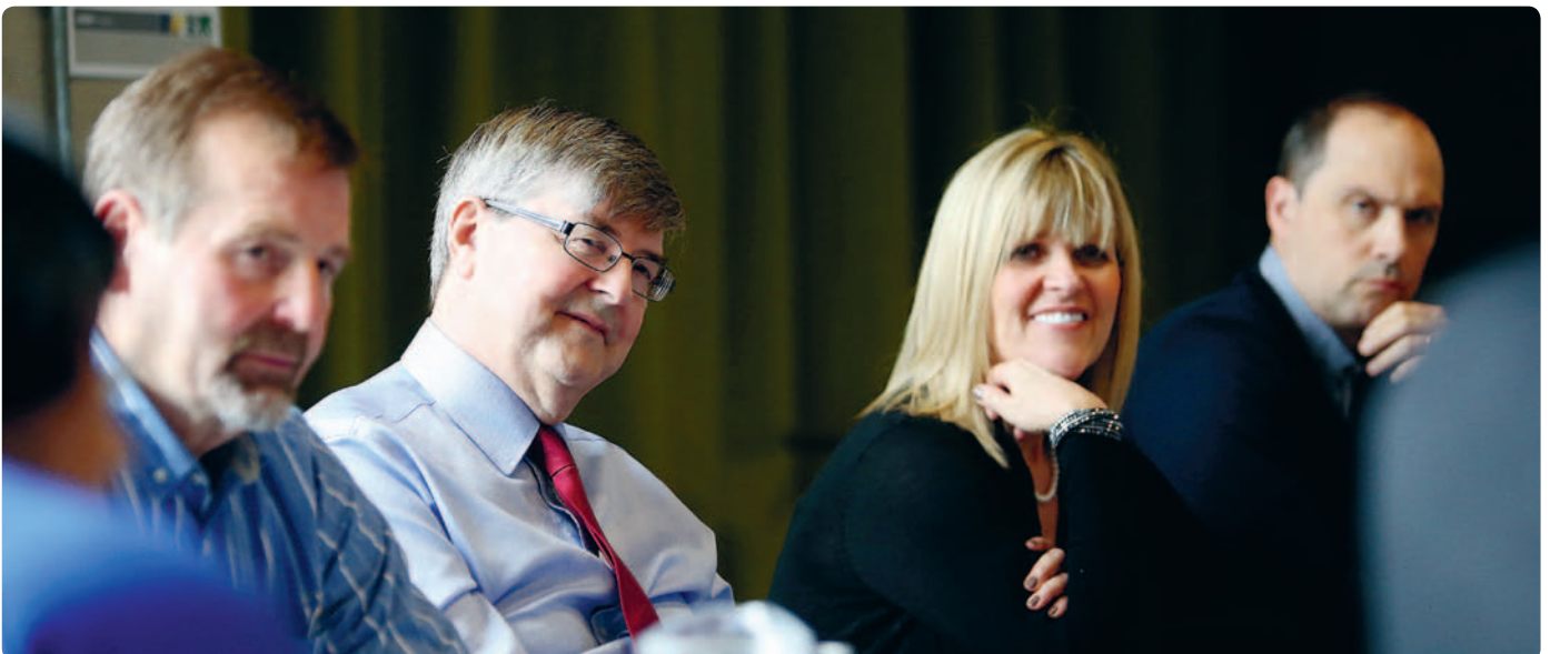
Audience Councils monitor audience views and assess BBC performance

An annual review from each Audience Council is available on their websites.