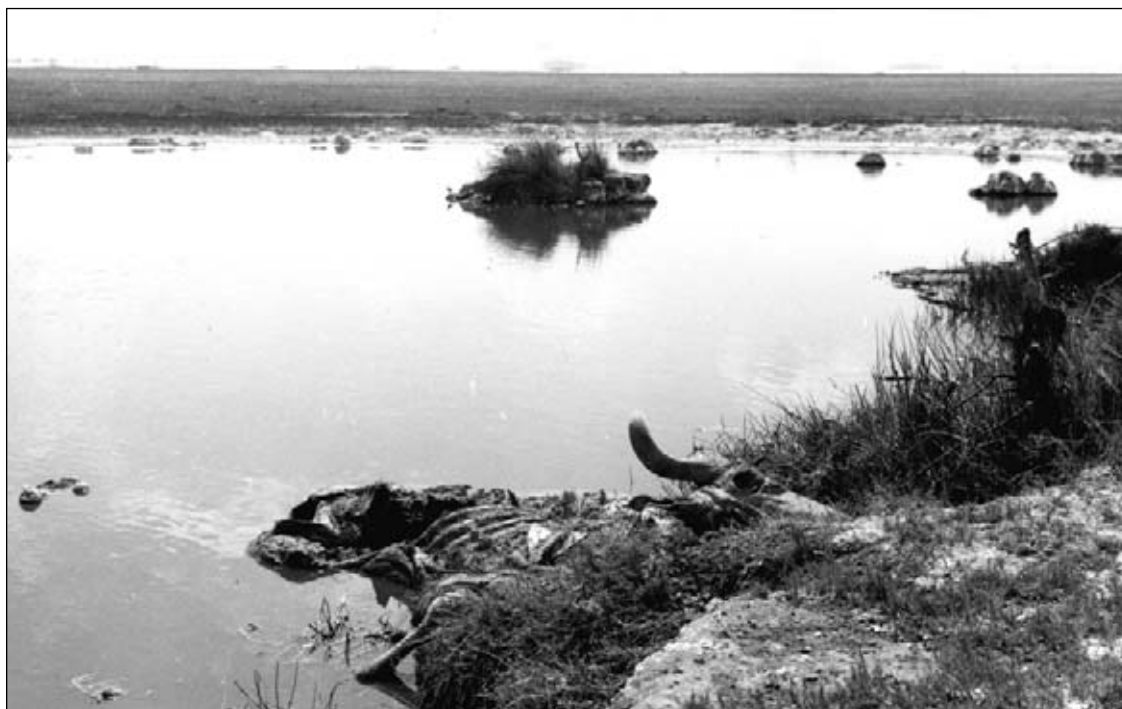
Figure 1.1. A wildebeest carcass, partly submerged in mud and water and on its way to becoming permanently buried and fossilized. If the bones are not protected from scavengers, air, and sunlight, they decompose rapidly and are gone in 10–15 years. Bones destined to become high-quality fossils must be buried soon after the death of the animal.

the bones are buried. At this point, they become fossils (the bones, not the paleontologists). The word “fossil” comes from the latin word fodere (to bury), and refers to anything that is buried. There is no implication of how much time the remains have been buried; a dog burying a bone is technically producing a fossil. A body fossil is what is produced when a part of an organism is buried. We distinguish these from trace fossils, which are impressions in the sediment left by an organism.