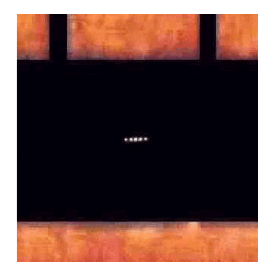
FIG. 3: Photograph of five beryllium ions in a lithographically fabricated RF trap. The separation between ions is approximately 10 microns.

There is no shortage of attempts to embody quantum bits in physical quantum states. Magnetic flux tubes can carry quantized units of flux, and be used in silicon-based systems as qubits. So can Cooper pairs (pairs of electrons in a superconducting state) in quantum dots. In that case, the charge state (which is quantized) plays the role of the qubit. In solid-state quantum computing, phosphorus dopants in a silicon array act as qubits, and are manipulated and accessed using metallic gates on the surface of the chip together with external ac and dc magnetic fields (Fig. 4).