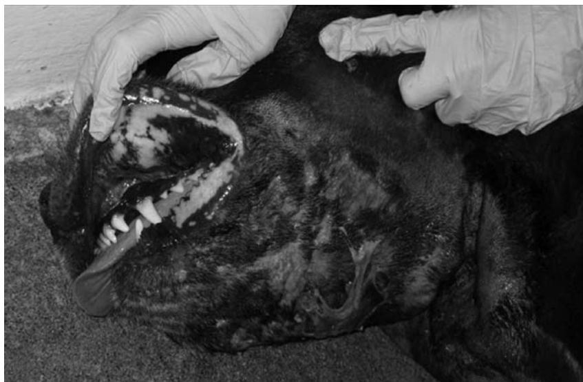
Figure. Extensive neck swelling with ulcerations and purulent discharge on 8-year-old spayed female Labrador retriever. Culture of the exudate and a macerated skin biopsy specimen grew methicillin-resistant Staphylococcus aureus . A color version of this figure is available online ( www.cdc.gov/EID/content/15/8/1329-F.htm ).