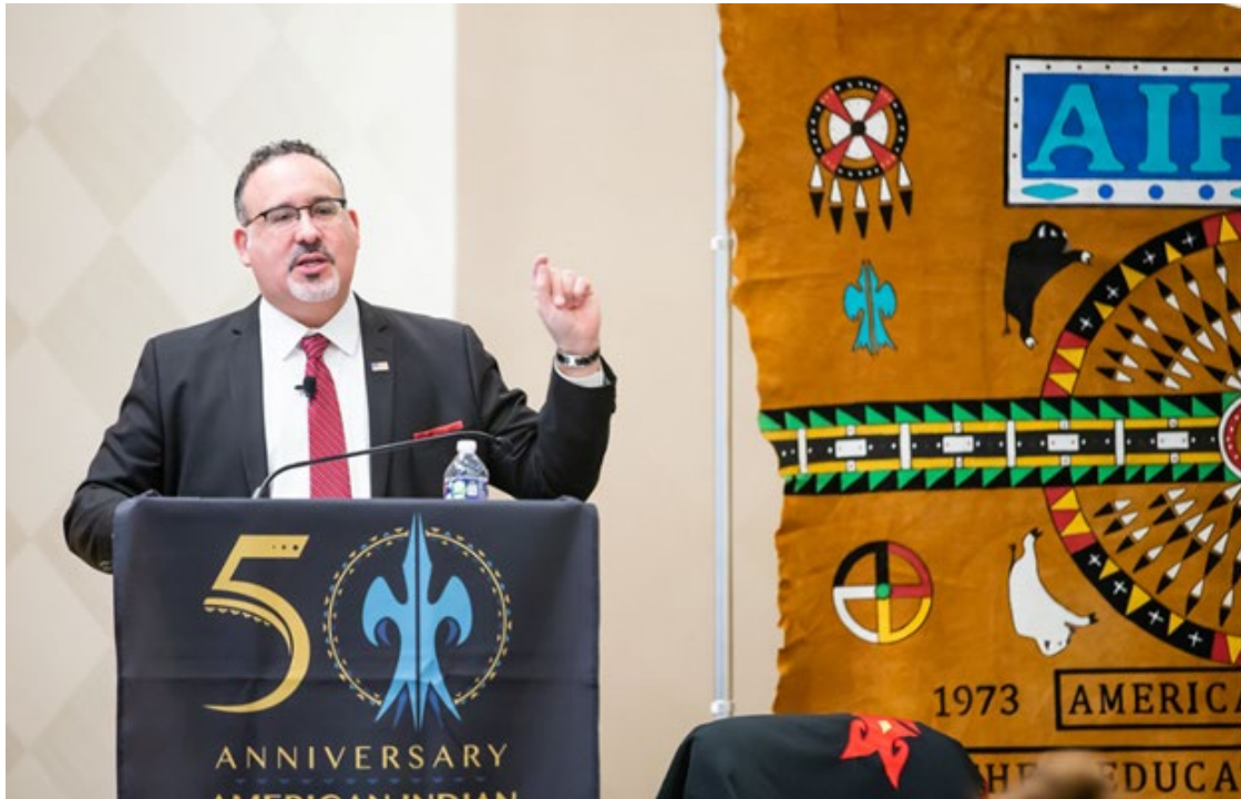
Secretary Miguel Cardona giving opening remarks at the American Indian Higher Education Consortium legislative conference emphasizing U.S. Department of Education's commitment to higher education for American Indian students.