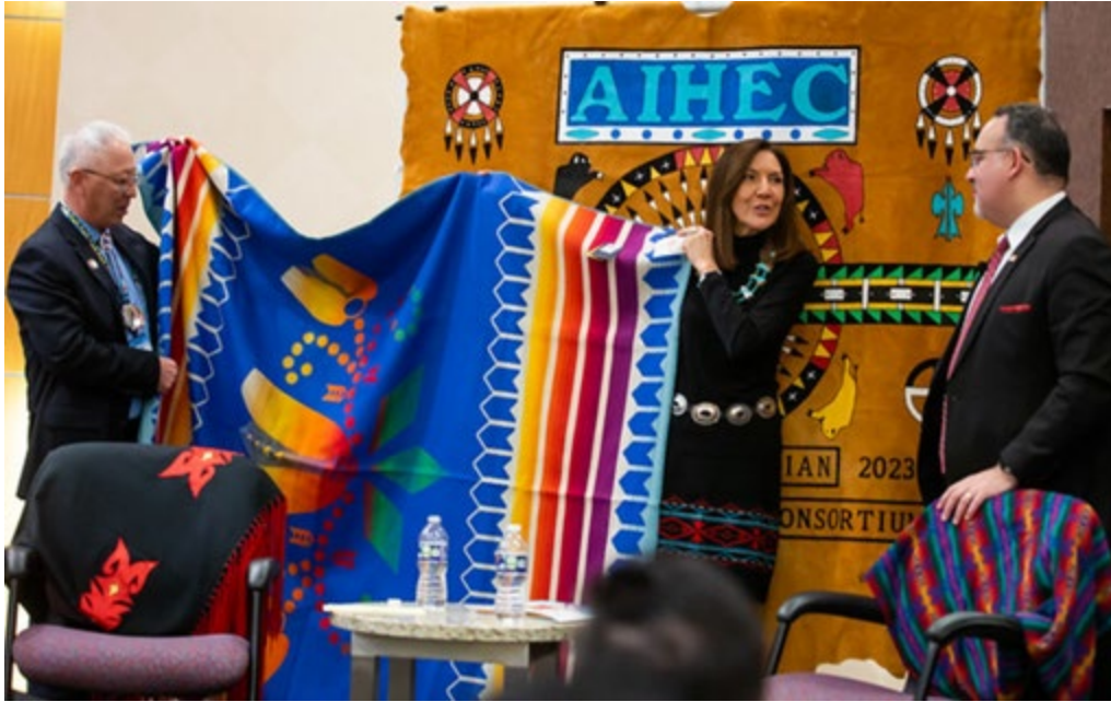
AIHEC leaders present Secretary Cardona with a commemorative gift.

The American Indian Higher Education Consortium held its annual legislative conference in 2023. Secretary Cardona gave opening remarks and shared his commitment to eliminate barriers for American Indians in accessing higher education.