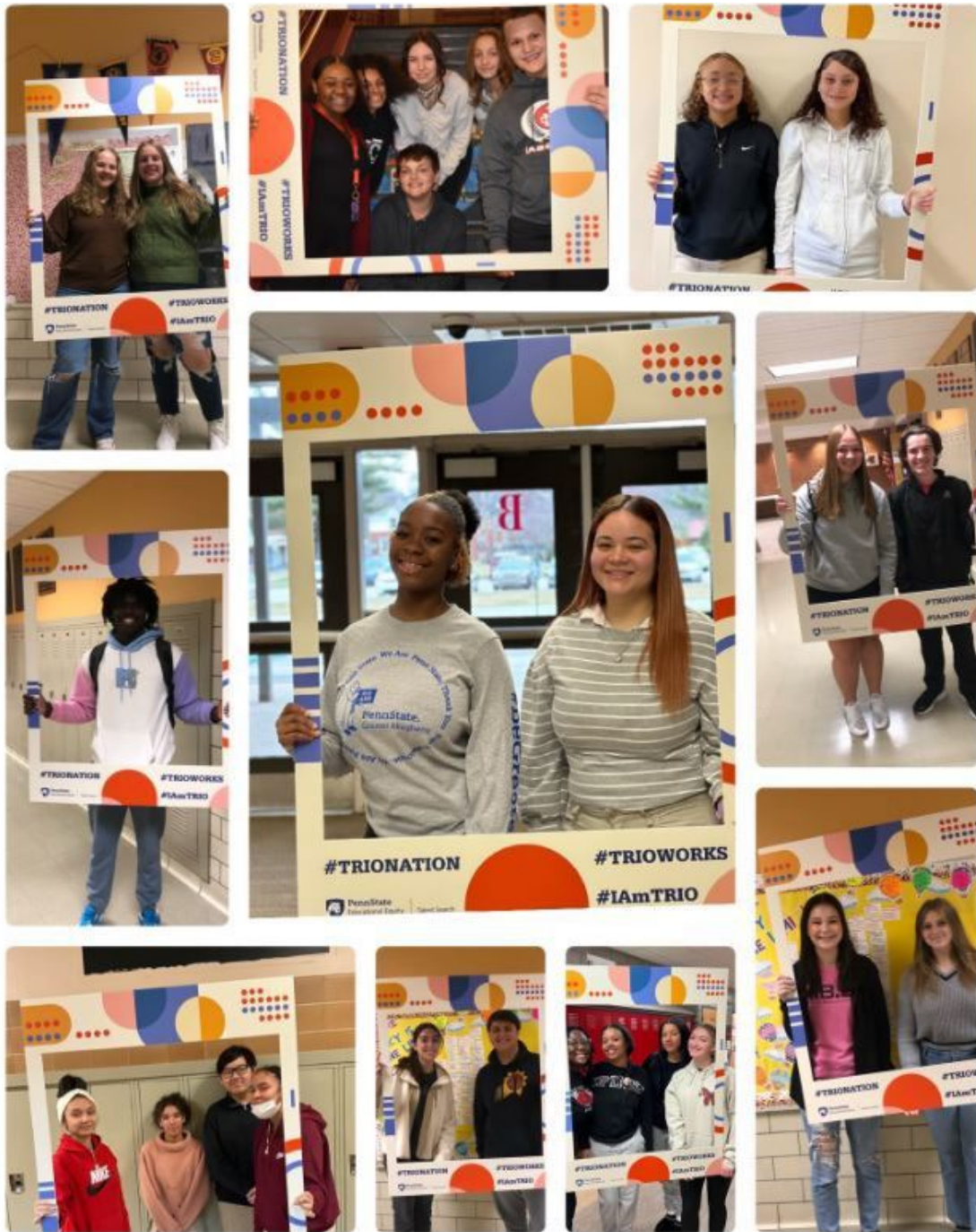
Penn State Talent Search celebrates TRIO Day in February 2023.

Counselors are now able to showcase people that potential participants can identify commonalities with so that Talent Search can be recognized as an inclusive space.