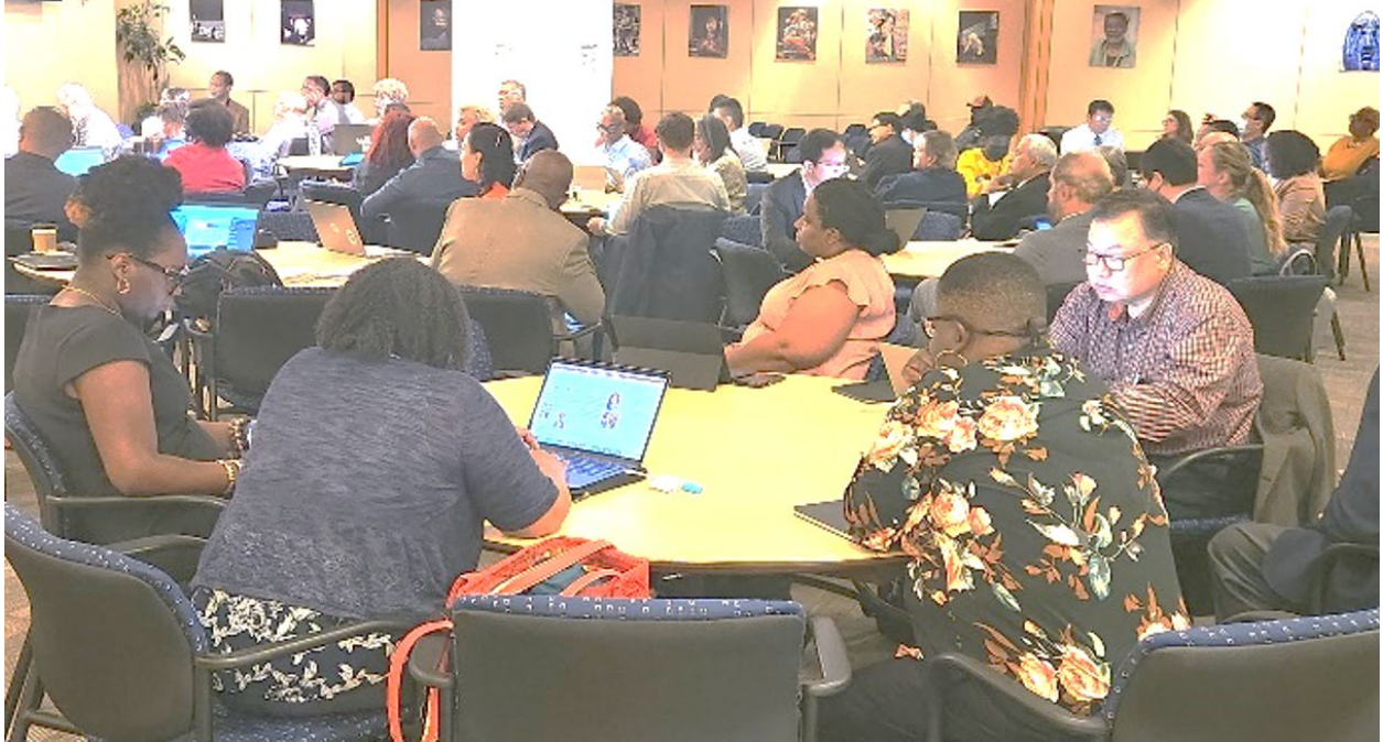
MSEIP conference participants shared their success stories with colleagues.

The MSEIP grantees celebrated the graduate students' research in such fields as face and voice comman