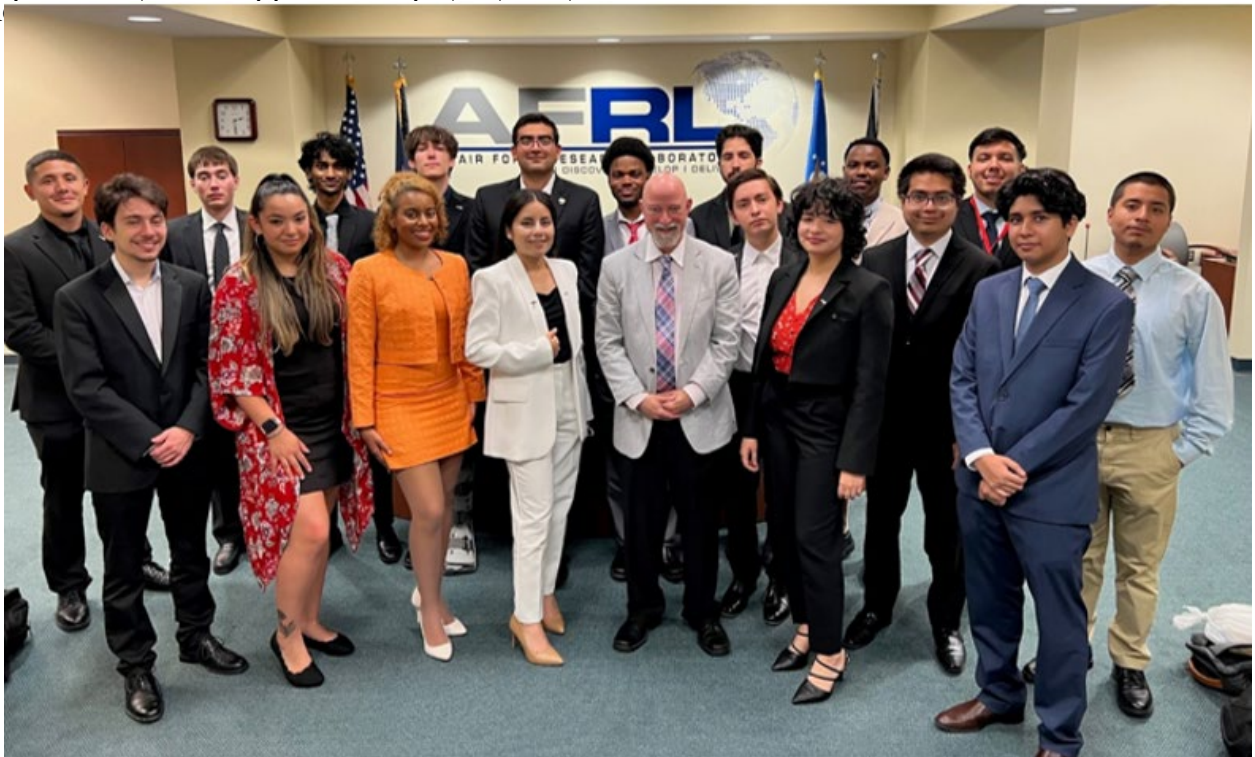
MSEIP grantee summer interns at the Air Force Research Laboratory.

The MSEIP grantees celebrated the graduate students' research in such fields as face and voice comman