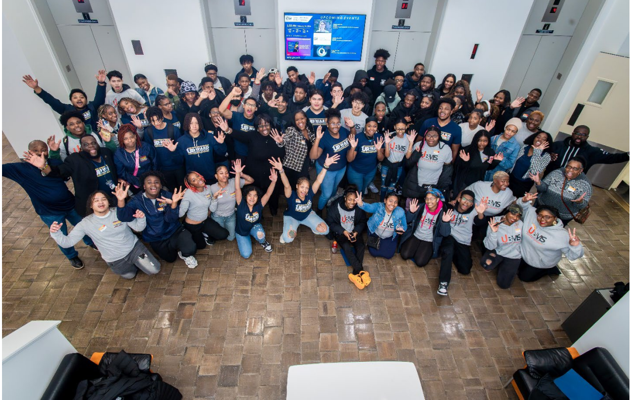
Students gathered at George Washington University to celebrate TRIO Day.

Representatives from GW, Howard University, Morgan State University, and the College Success Foundation participated in various workshops, and student-led panels, and heard from alumni and TRIO stakeholders. Email OPE's TRIO programs at OPE_TRIO@ed.gov for more information.