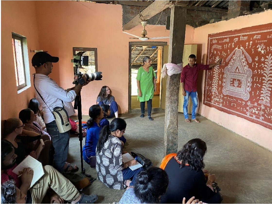
YHS Fulbright-Hays GPA 2022 participants learning about World Readiness Standards.

The tour played an important role in ensuring that the teachers integrated the World Readiness Standards into the teaching materials, the American Council on the Teaching Foreign Languages proficiency guidelines, and best practices for teaching and learning heritage languages. Yuva Hindi Sansthan received a second Fulbright-Hays GPA award in fiscal year 2023.