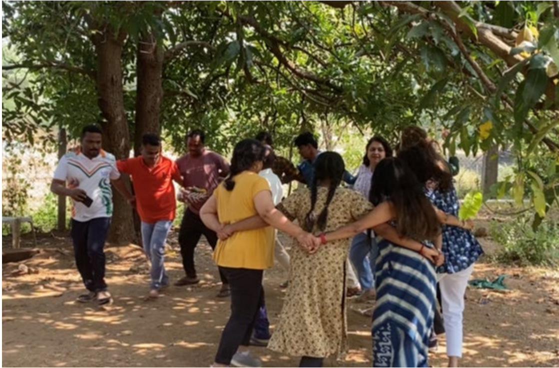
YHS Fulbright-Hays GPA 2022 participants practicing folk dancing with Warli villagers.

Participants were required to study the impact of climate change within the cultural contexts of India and to become aware of the sustainable lifestyles of local communities. They were also required to collect authentic materials in the native culture of India, such as resources related to climate change and sustainable living.