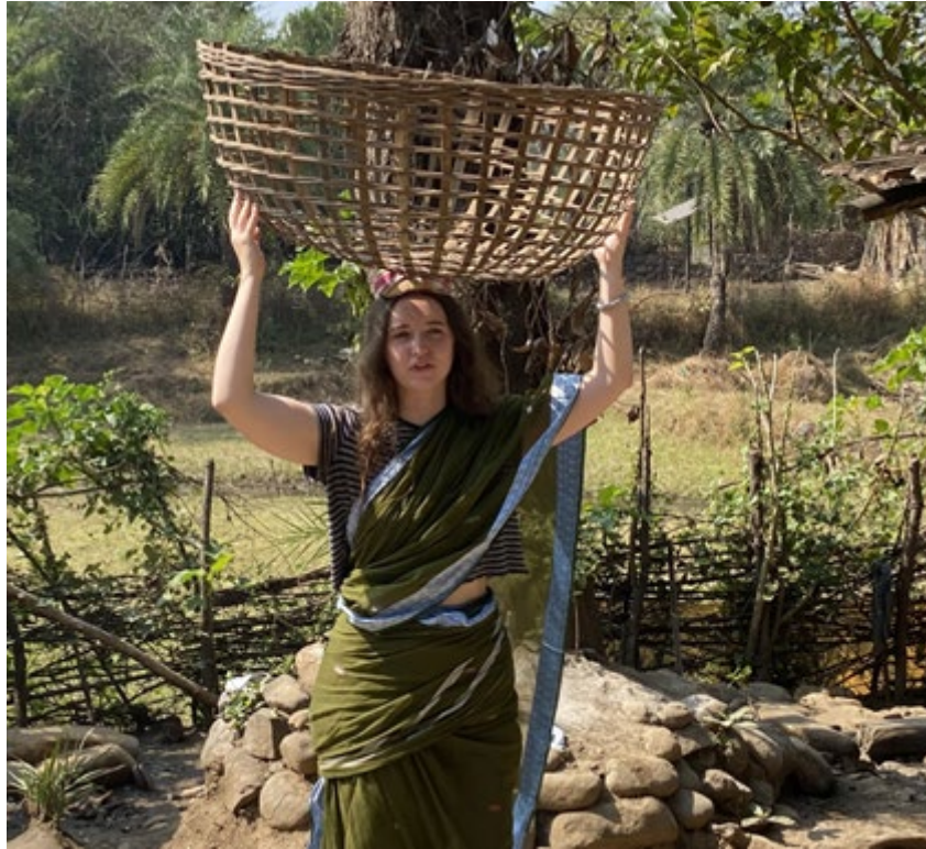
Yuva Hindi Sansthan Fulbright Hays Group Projects Abroad Program participant explores natural materials and daily life in India.