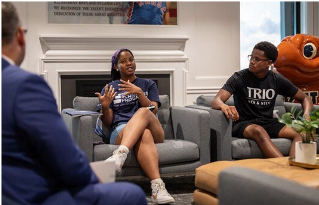
Secretary Cardona (left) listens to McNair and TRIO program students explain the benefits of OPE grant funds as they pursue higher education.

On Sept. 5, U.S. Secretary of Education Miguel Cardona launched the “Back to School Bus Tour 2023: Raise the Bar.” This week-long, multi-state road trip showcased the many ways schools, families, and communities are doubling down on accelerating student learning and raising the bar in education.