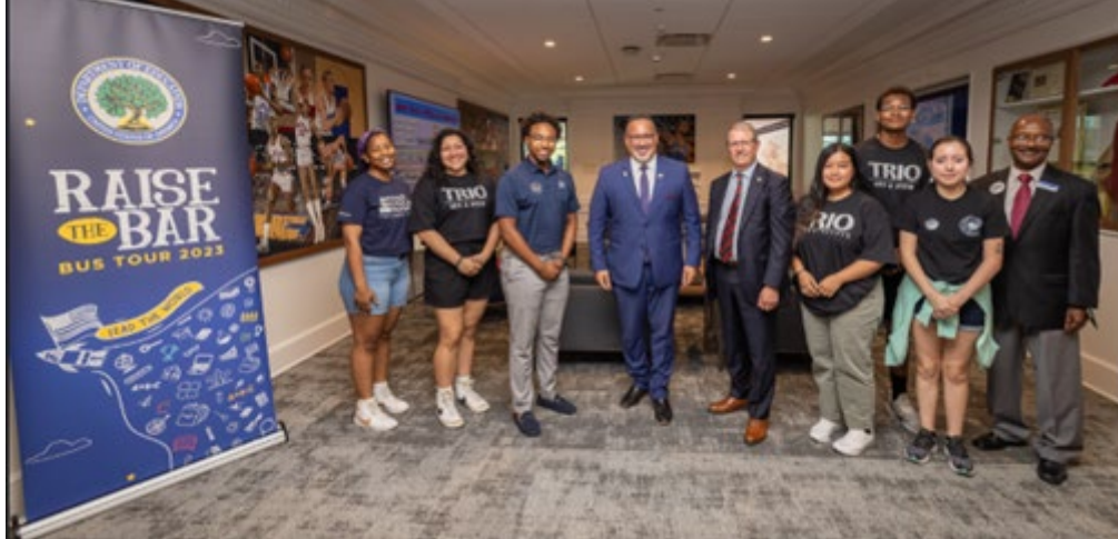
Group Photo with Secretary Cardona and students of the McNair and TRIO programs attending Kansas.

On Sept. 5, U.S. Secretary of Education Miguel Cardona launched the “Back to School Bus Tour 2023: Raise the Bar.” This week-long, multi-state road trip showcased the many ways schools, families, and communities are doubling down on accelerating student learning and raising the bar in education.