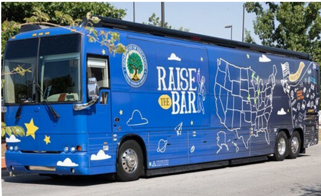
The Raise the Bar bus.

Harris-Stowe students shared details on how OPE grants were vital to their postsecondary education programs. Grants helped students pay for Wi-Fi and tuition fees and offered them a second chance at higher education.