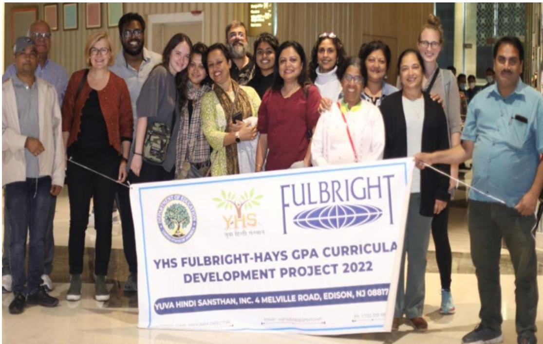
Yuva Hindi Sansthan Fulbright Hays Group Projects Abroad Program participants arrive at Delhi Airport in India.