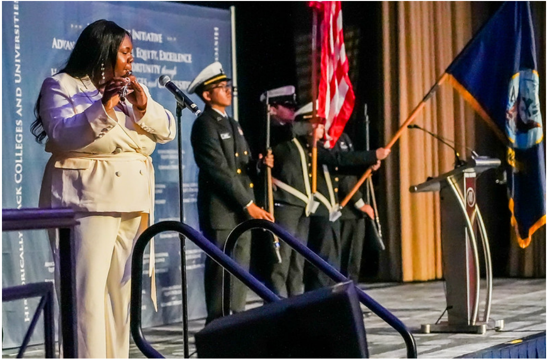
Student flute performer and military color guard.