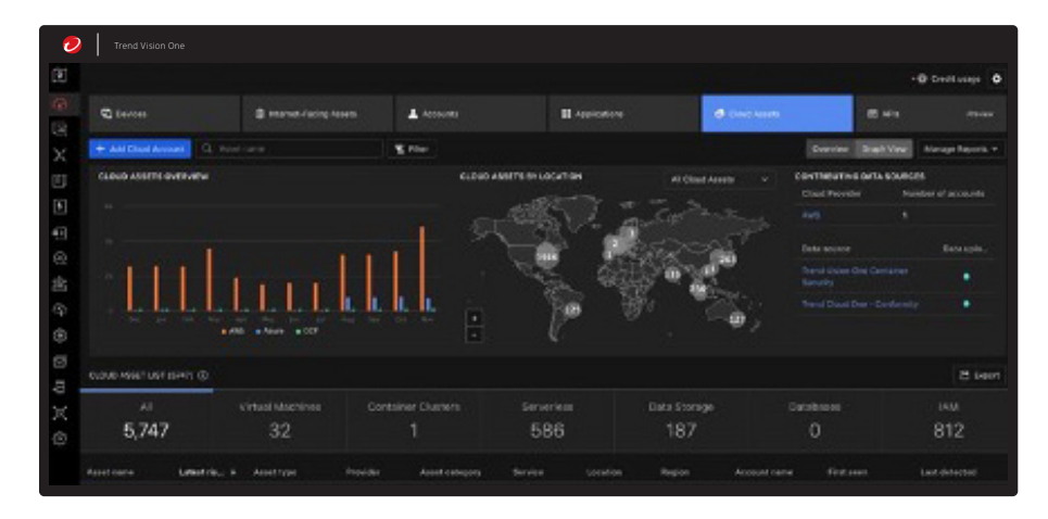
Figure three: cloud posture overview in Trend Vision One