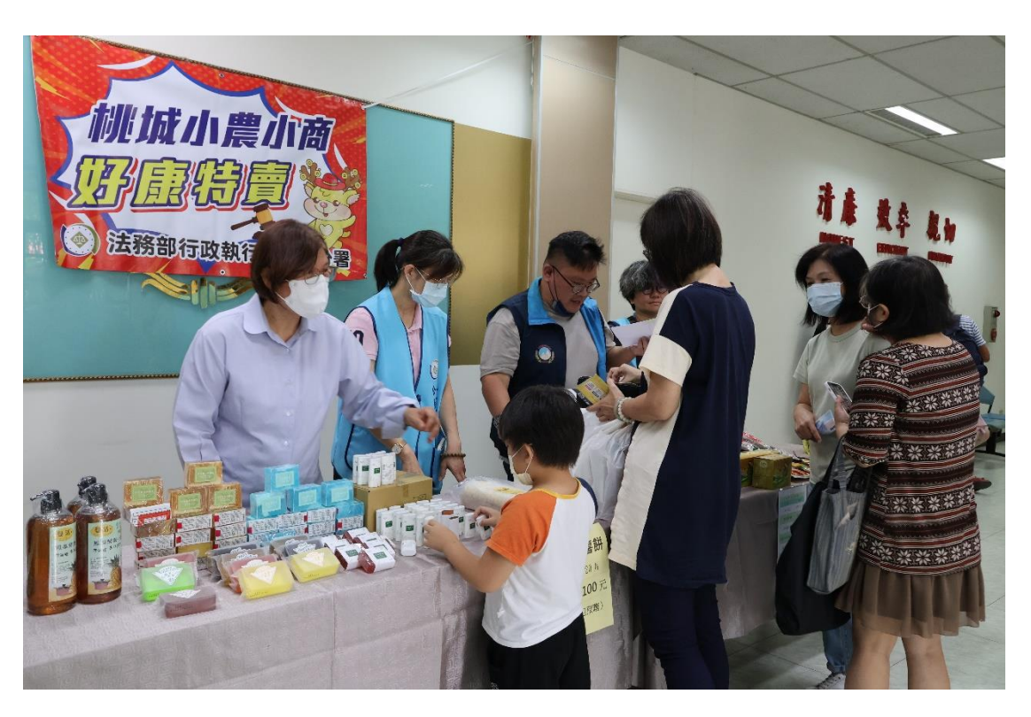
The Chiayi Branch held the "Grand Sales of Local Farmers and Merchants"