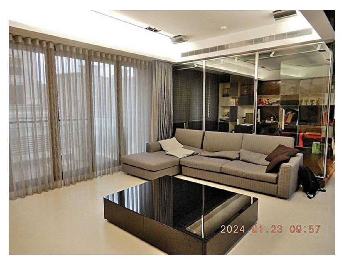
The Shilin Branch auctioned the orange, yellow and black McLaren 570S Coupe sports car