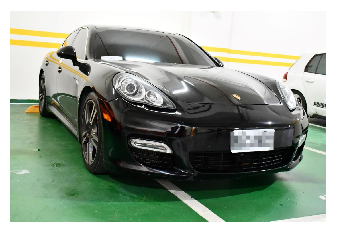
The Shilin Branch auctioned the black Porsche PANAMERA TURBO RV