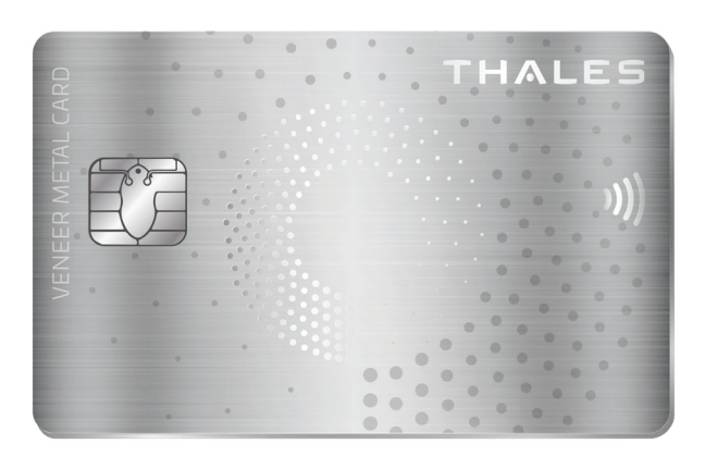
It offers a huge number of design possibilities in terms of colors, patterns, engraving features and texture, making it a favorite with innovative banks looking to create a buzz.

The Veneer Metal Card has a distinctive metallic touch and feel, courtesy of the 'cold touch' metal on its surface and the visible metal on its edges as well as on the mechanically engraved logos.