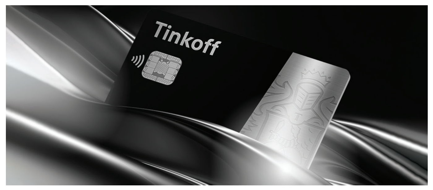
Tinkoff Black Metal, Russia

Thales's many satisfied customers include Curve in the UK, Foris in Hong Kong, and Tinkoff in Russia. Thales has helped fintech Curve to ensure the seamless rollout of its innovative, premium solution. Meanwhile, Foris, the company behind the MCO platform and app, is harnessing the power of Thales metal cards to differentiate itself from the myriad offerings being rolled out by other blockchain and cryptocurrency fintechs in Asia, Europe, and North America. Russian digital giant Tinkoff also looked to Thales for their prestigious new Black Metal card that marries the convenience of contactless payment with the beauty of metal, with the aim of increasing brand loyalty and boosting the appeal of its premium service program.