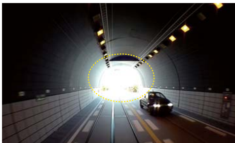
Wide dynamic range function : OFF