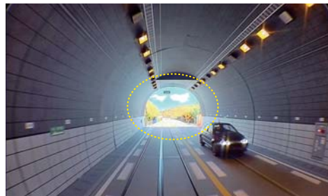
Wide dynamic range function : ON