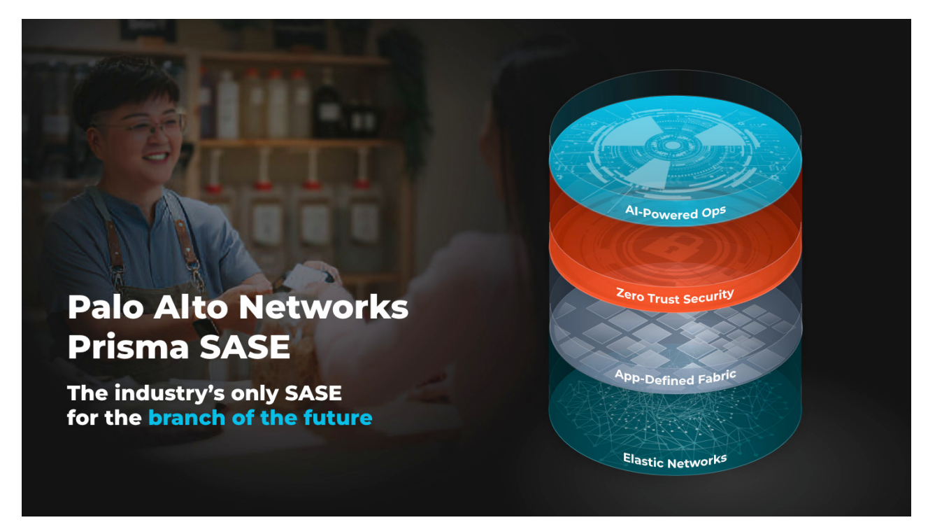
Figure 1: The industry's most flexible SASE model