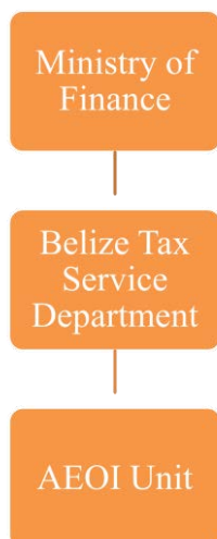
Figure 1. Competent Authority Organisational Structure