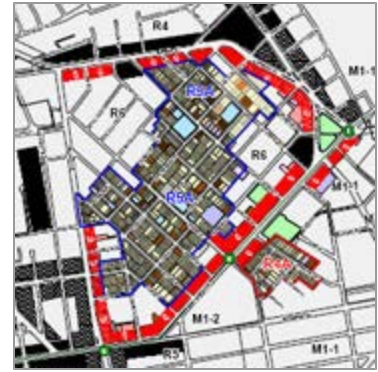
Proposed Zoning & Configurations

Sixteen full blocks and portions of 16 others north of Westchester Avenue would be rezoned from R6 to R5A, a new zoning district proposed for the Olinville Rezoning in Bronx Community District 12. One full block and portions of three blocks south of Westchester Avenue would be rezoned from R6 and M1-1 to R4A. In addition, DCP proposes to rezone 22 commercial overlays to reduce parking requirements on shopping streets close to transit, eliminate one entire commercial overlay and part of another, and add one new commercial overlay. The depth of existing 150-foot commercial overlays would be reduced to 100 feet.