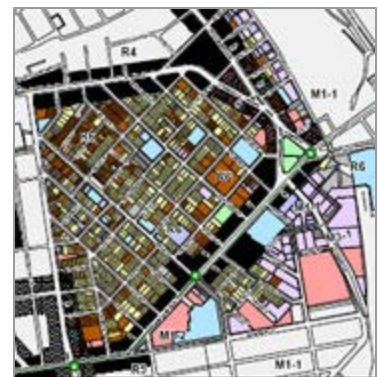
Existing Zoning & Configurations