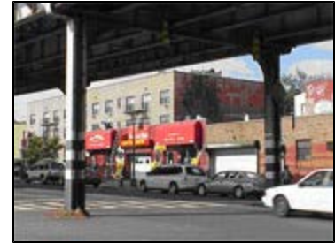
Multi-family buildings and commercial uses along the elevated subway line on Westchester Avenue and Doris Street