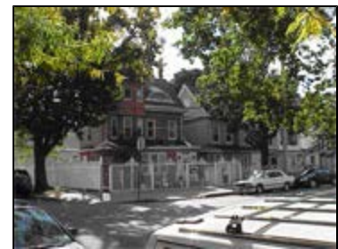
Large detached homes at Hershell Street and Butler Place in the proposed R4A

To preserve the residential character of detached one- and two-family homes, new development would be limited to one- and two-family detached homes with a minimum lot size of 2,850 square feet for one-family detached homes and 3,135 square feet for two-family detached homes; a minimum lot width of 30 feet for one-family detached homes and 33 feet for two-family detached homes; a FAR of 0.75 (+ 0.15 attic allowance); a minimum front and side yard requirement of 10; a maximum height of 35 feet with a 26 foot perimeter wall; and an increased parking requirement of 1.5 parking spaces per dwelling unit. The R4A district will be subject to the Lower Density Growth Management Area (LDGMA) regulations which, among other provisions, increase off-street parking requirements for new development, reduce the maximum height of new buildings in the floodplain areas and establish a 20-foot side yard on corner lots.