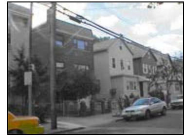
Large detached homes on Glebe Avenue in the proposed R5A

To preserve the existing character of large, single- and two-family detached homes, new development would be limited to one- and two-family detached homes with a minimum lot size of 2,850 square feet; a minimum lot width of 30 feet; an FAR of 1.1 (with a 300 square-foot increase for providing a detached garage in the rear yard); a minimum front and side yard requirement of 10 feet (or for front yards, as deep as the adjacent yard); a maximum height of 35 feet (with a 25-foot perimeter wall maximum); and an increased parking requirement of one parking space per dwelling unit.