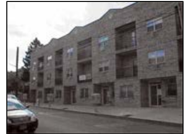
New out-of-character multi-family construction on Glebe Avenue

For more information, contact the Bronx Office of the Department of City Planning at (718) 220-8500.