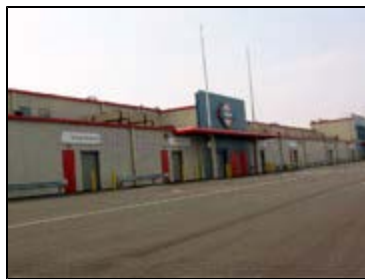
New Fulton Fish Market

The 22 block Hunts Point residential neighborhood is located on the north-western portion of the peninsula, and is predominately characterized by a mix of row-houses and medium density apartment buildings varying in height from two to eight stories. The neighborhood is completely surrounded by manufacturing uses, including non-compatible uses such as scrap yards and waste transfer stations.