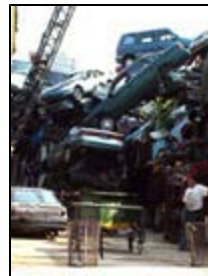
Open junk yard in Hunts Point

Hunts Point's negative image persists in the city despite the fact that it houses one of the largest food distribution centers in the world and a thriving platform for small industrial businesses, which provide approximately 10,000 jobs. The presence of a vibrant residential community and the emergence of a thriving visual and performance arts scene represented by the Point could be strengthened. Moreover, open industrial uses like scrap yards, storage of parts and materials, junk yards, etc. negatively impact the physical appearance of Hunts Point, and hence diminish the value of the land and property as well as contribute to the negative image of the peninsula.