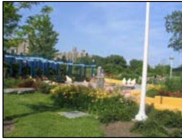
Hunts Point Riverside Park