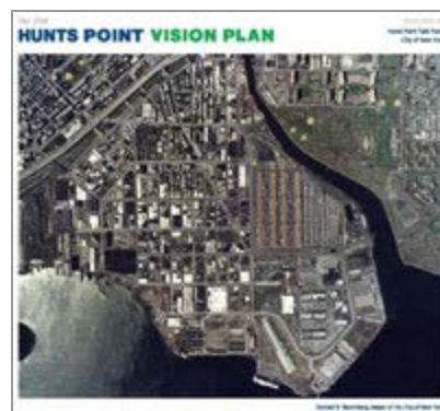
Hunts Point Vision Plan

The Task Force continues to meet on a quarterly basis at the offices of Bronx Community Board 2. Copies of the full Hunts Point Vision Plan are available from the Hunts Point Vision Plan in 2004