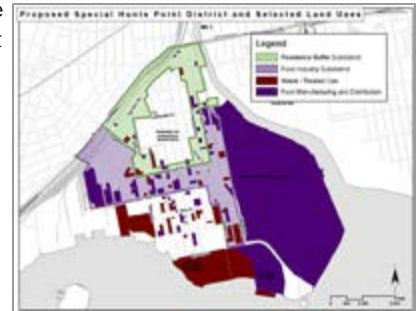
Proposed Special Hunts Point District - View a larger image