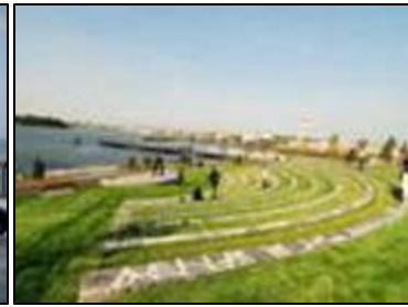
Barretto Point Park