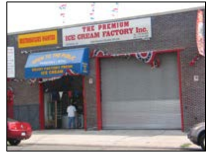
Ice cream distributor on Randall Avenue in the proposed Food Industry subdistrict.

All manufacturing, commercial and storage activity, including storage of automotive parts and materials, would be required to take place within a completely enclosed structure. This enclosure provision will help improve the physical appearance of Hunts Point.