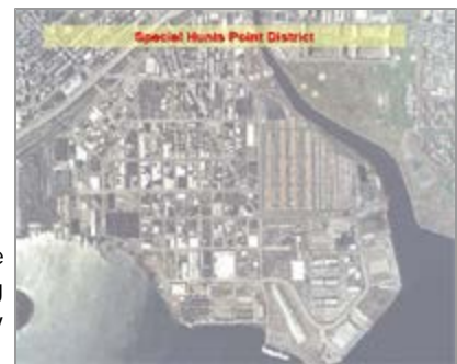
Special Hunts Point District Presentation - View the presentation