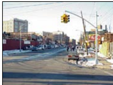
Open auto-related uses and residential development on Hunts Point Avenue

About eight percent of the industrial area, excluding the Hunts Point Food Distribution Center, is vacant land/ buildings and about five percent consists of parking lots, salvage yards and waste-related uses. The land in the peninsula is limited and its use should be maximized to spur economic development and job opportunities for the community.