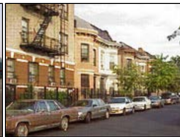
Manida Street - Residential Neighborhood: medium density apartment houses and row houses on Manida Street.

There are some small local retail shops along Hunts Point Avenue, but the residential community and the employees lack retail options in the area. The peninsula is under-served by large grocery stores or supermarkets. Hunts Point is also home to a growing arts and culture scene, led by the Point, which has been a vibrant and pro-active community center in the neighborhood. The remainder of the peninsula is comprised of a diverse mix of small industrial businesses, including food-related, manufacturing, construction, utility, auto-related, warehousing /distribution, and waste-related uses such as waste transfer stations.