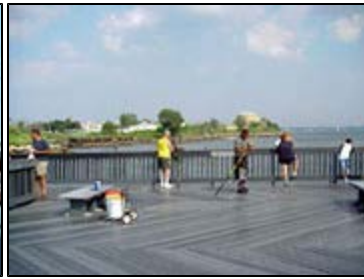
Tiffany Street Pier