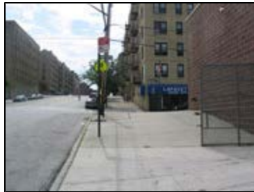
Mid-density apartment buildings along Lafayette Avenue in the residential core.

On July 23, 2008, the City Council adopted the actions with modifications to the Special Hunts Point District. View the CC Modifications , View the CPC modifications and read the CPC Reports .