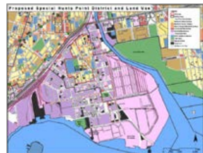
Land Use and Existing Zoning

An R6 zoning district is currently mapped over 22 blocks at the heart of the Hunts Point peninsula. This residential district is made up of a mix of row-houses and medium-density apartment buildings varying in height from two to eight stories. R6 is a height factor district with no height