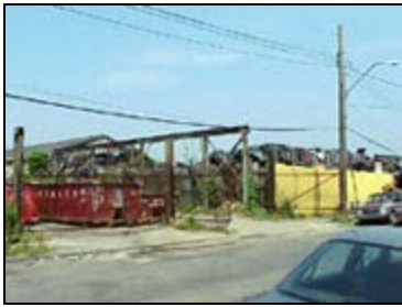
An open scrap yard on Barretto Street