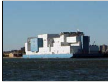
Prison barge in Hunts Point

About eight percent of the industrial area, excluding the Hunts Point Food Distribution Center, is vacant land/ buildings and about five percent consists of parking lots, salvage yards and waste-related uses. The land in the peninsula is limited and its use should be maximized to spur economic development and job opportunities for the community.