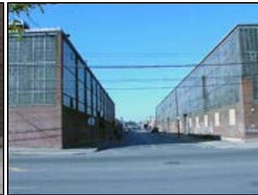
Hunts Point has been an industrial stronghold since the early 20th century, as evidenced by loft buildings on Worthen Street.