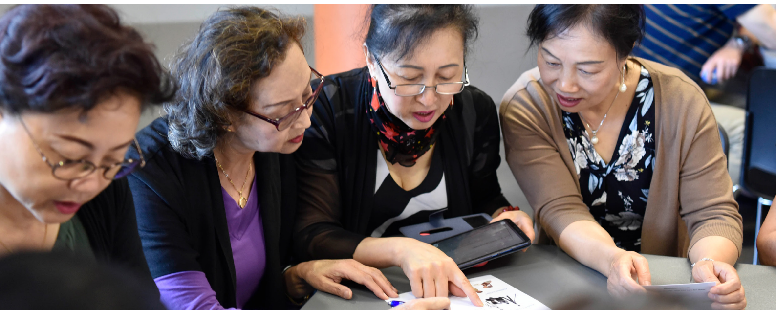
Flood awareness workshops with diverse communities in Western Sydney.

Please contact us with any questions or feedback via email: sdmp@reconstruction.nsw.gov.au