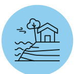
Coastal hazards (erosion and inundation)