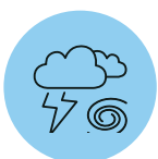
Storms and cyclones