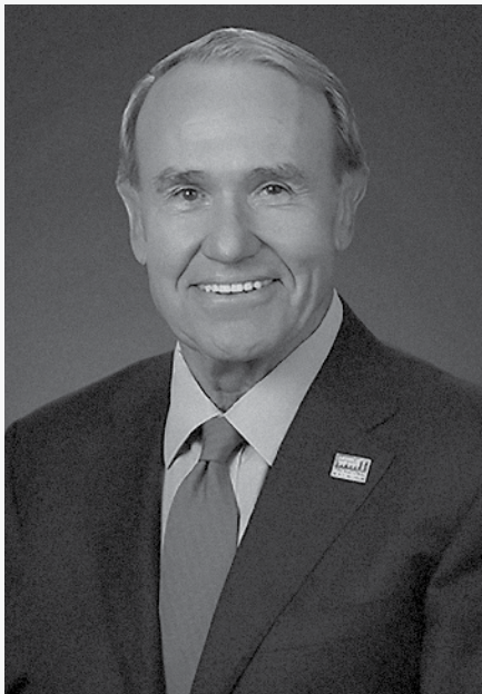
JAMES A. COURTER

Fiscal Year 2016 saw achievement in many areas by staff members, volunteers, and generous supporters. Not least among these milestones were two sterling thresholds passed during March 2016: A total of 81,703 visitors explored the Museum's galleries, smashing the previous monthly record of 73,449. In the same month, the Museum welcomed its 5 millionth visitor. We're honored that about 1 million of those lifetime visitors have been school-age children; of those, more than 750,000 have visited through field trips and other school programs.