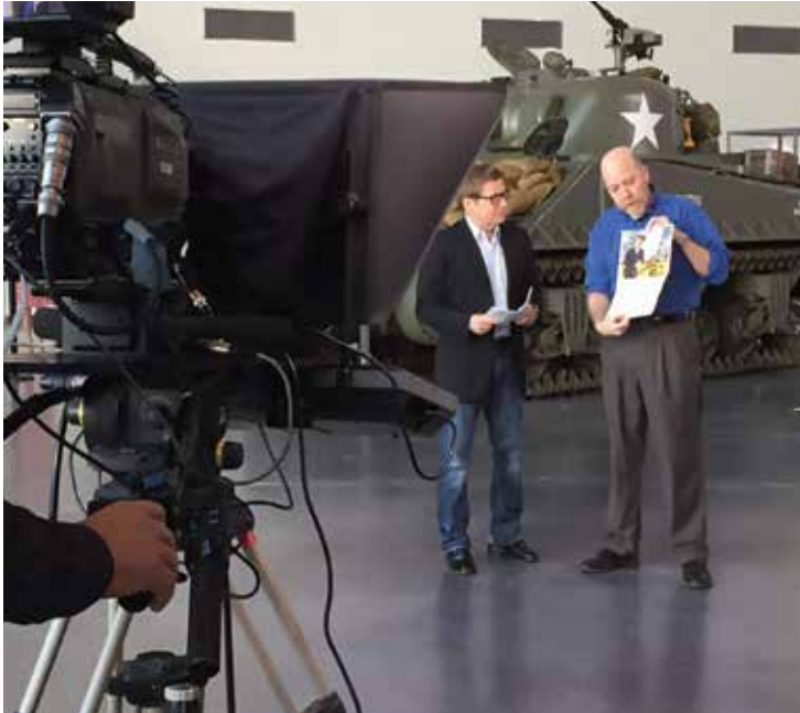
BELOW From their own school, students participate in an educational webinar produced live from the Museum.