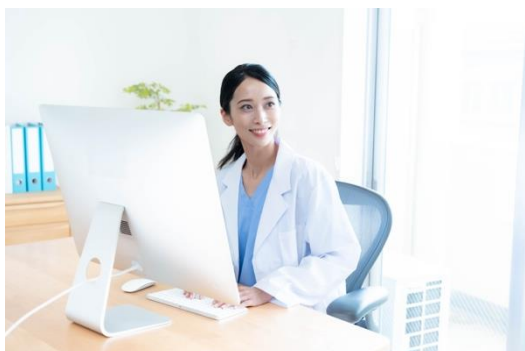
Image of on-site clinic

Some floors of the property are devoted to care services for residents who require care later in life. On these floors, dedicated care staff provide 24-hour life support services. Combined with outsourced care insurance services (with the option of selecting the care insurance service provided by the care insurance office in the property), the property provides life support tailored to individual needs.