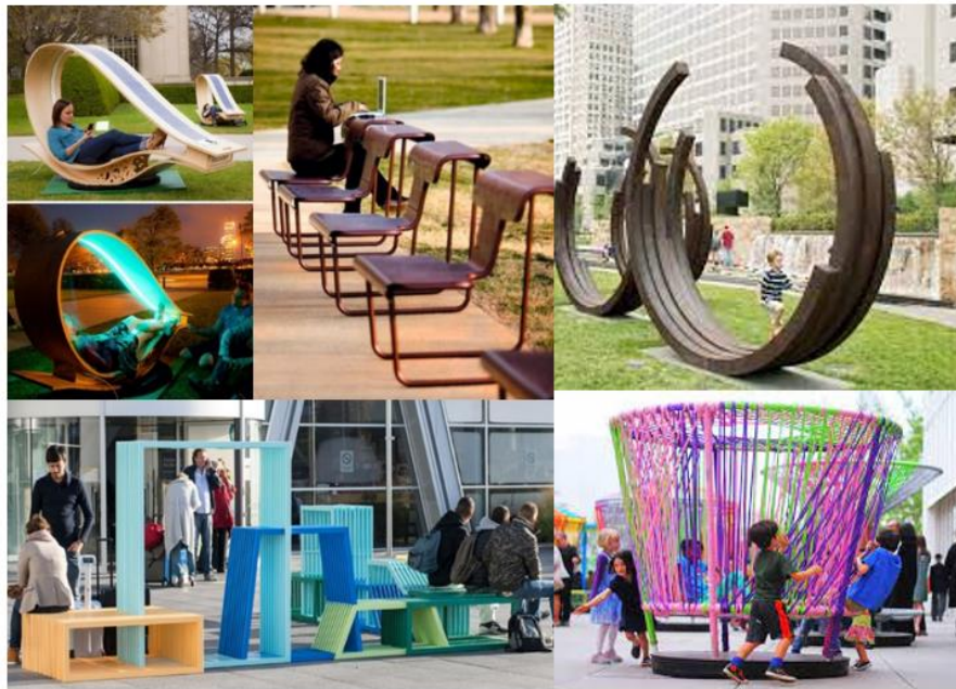
For illustrative purposes only.

Legion Park has recently undergone renovations, with improvements to the grounds and the historic structure on site. The work is inclusive of interior and exterior repairs to the community room, a new tennis court, new light poles throughout, and the addition of an outdoor terrace facing the bay. The new outdoor terrace may serve as a multi-functional space. There are multiple areas of opportunity for public art.