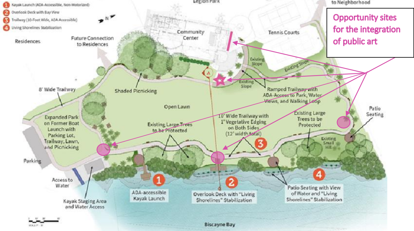
Diagrammatic Plan showing proposed park improvements to East Lawn.