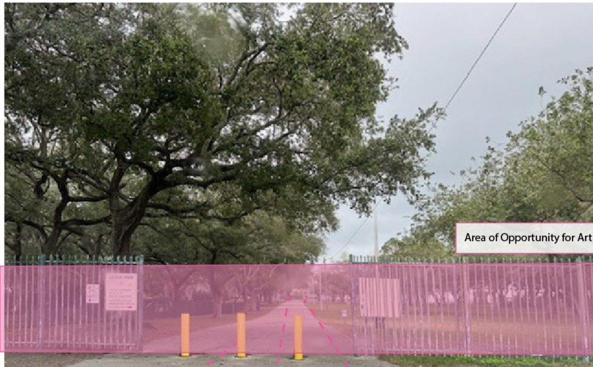
Park Entrance from Biscayne Blvd. Alternate Area of Opportunity- entrance fence/gate.