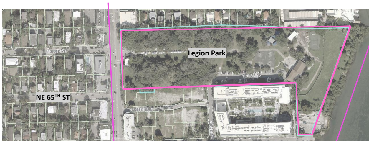
Aerial view – Legion Park