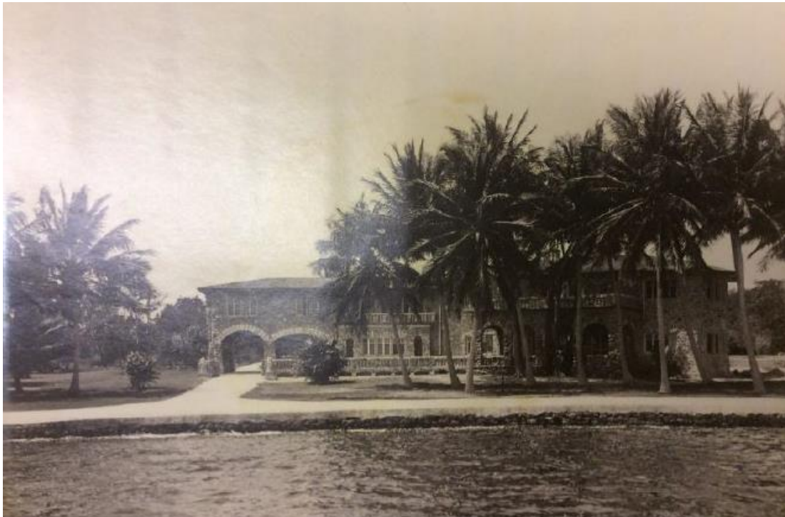
Tee House Plantation, Lemon City Florida. History Miami Archives