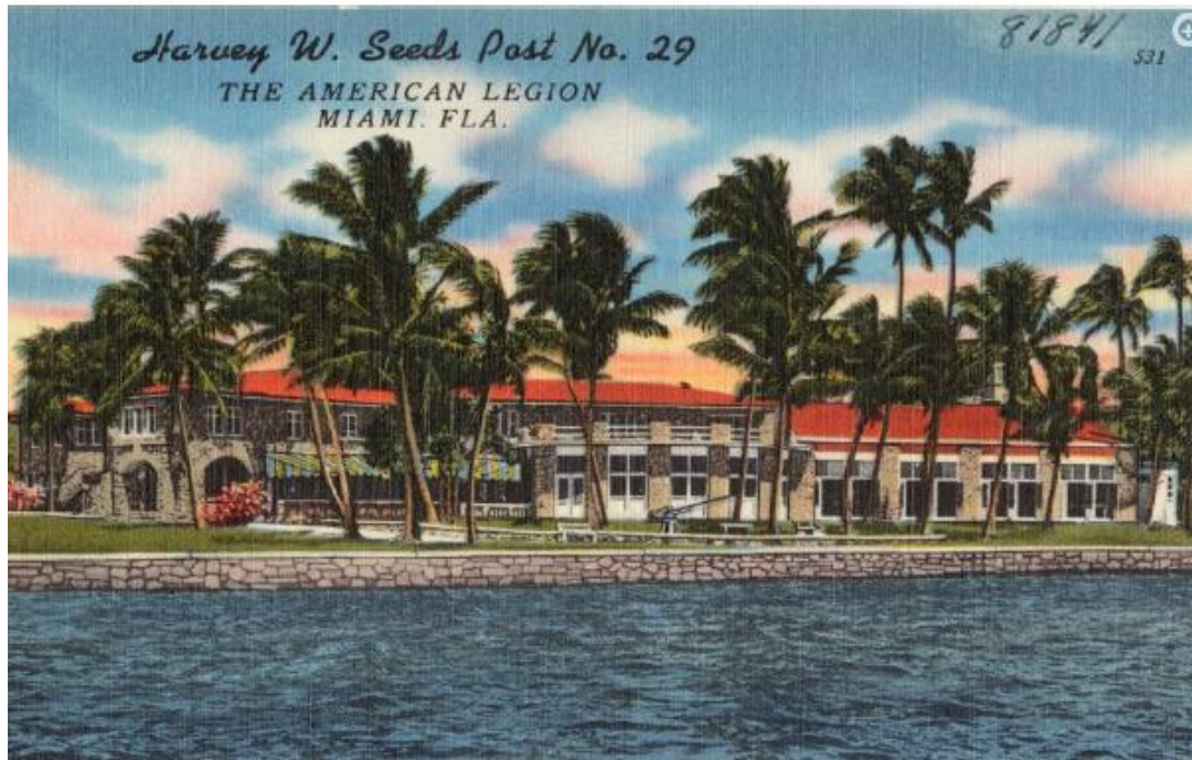
Color postcard for Harvey W. Seeds Post No. 29, the American Legion, Miami Florida. https://www.digitalcommonwealth.org/search/commonwealth:6108vg16g